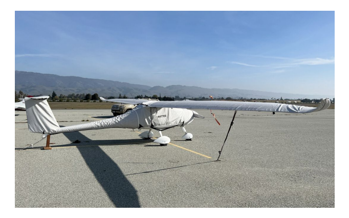
Pipistrel Sinus LSA Full Cover Set

WINTER USE MATERIAL - Made with Solution-Dyed Polyester fabric, this option is intended for seasonal use to aid in deicing, rain mitigation, or for occasional travel. The material is lighter and more compact, but more susceptible to UV damage and may have a shorter useful life if used continuously outside than the all-year use material.