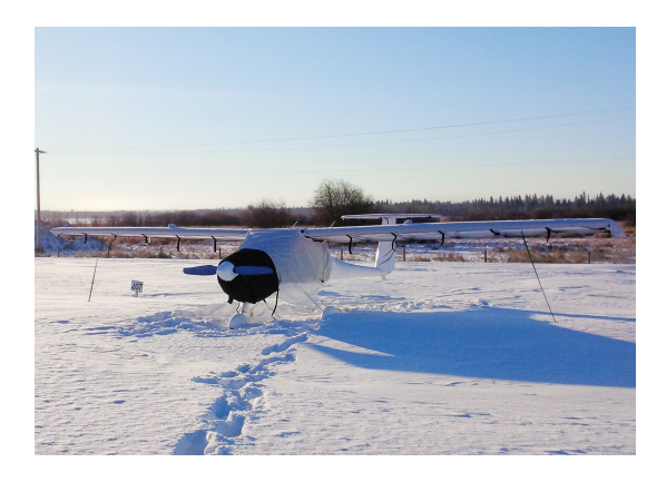
Pipistrel Canopy, Wings, Tail & Insulated Engine Covers