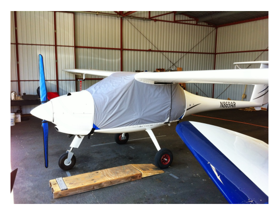
Pipistrel Light Weight Travel Canopy Cover

Travel Covers are made with Silver Solution-Dyed Polyester fabric and only lined over the windshield to save weight. The material is lightweight and more compact for easy stowage in the aircraft. The polyester material is water resistant, but only intended for occasional use outside. We also have an ultra lightweight material available for fitted hangar dust covers. For daily outdoor use, the non-travel Sunbrella Cover is the best choice.