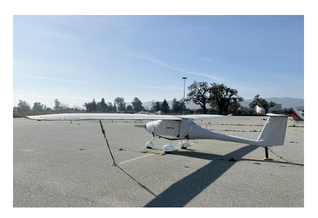
Pipistrel Sinus LSA Full Cover Set

This cover type is made from Silver Acrylic Sunbrella canvas and is 100% lined with a soft and smooth microfiber. Bruce's Custom Covers developed this material combination especially for aircraft protection. The outer material is medium weight and treated for water resistance, UV resistance and anti-static buildup. The inner lining is a very soft and smooth microfiber to prevent scratching. The material is very reflective, and tests show that the cabin interior temperature can be reduced to near-ambient temperature on the hottest of days. It is water, ice and snow repellent, yet breathable to allow moisture to escape from between the cover and the aircraft surface.