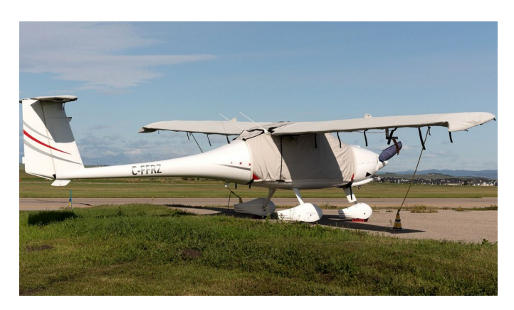
Pipistrel Virus SW Canopy & Wing Covers