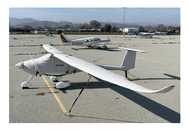
Pipistrel Sinus LSA Full Cover Set

This cover type is made from Silver Acrylic Sunbrella canvas and is 100% lined with a soft and smooth microfiber. Bruce's Custom Covers developed this material combination especially for aircraft protection. The outer material is medium weight and treated for water resistance, UV resistance and anti-static buildup. The inner lining is a very soft and smooth microfiber to prevent scratching. The material is very reflective, and tests show that the cabin interior temperature can be reduced to near-ambient temperature on the hottest of days. It is water, ice and snow repellent, yet breathable to allow moisture to escape from between the cover and the aircraft surface.