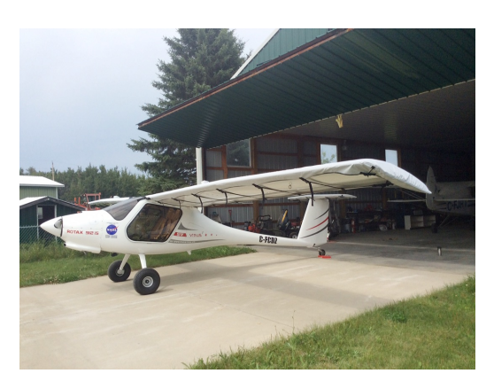
Pipistrel Virus Wing & Horizontal Stab. Covers