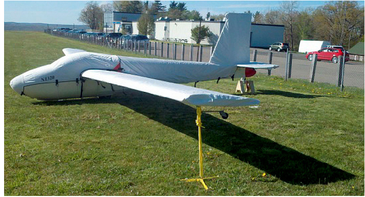
SGS 1-26B Canopy/Nose, Empennage & Wing Covers