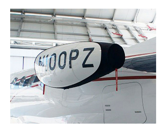
Phenom 100 "Bikini" Engine Covers

The Embraer Phenom 100 (EMB-500) Intake/Exhaust Plugs are custom fit for the intake and exhaust openings, made with heavy-duty vinyl material, and stuffed with a single block of sculpted urethane foam. Each plug has a zipper that allows the foam to be removed and dried if necessary. Engine plugs have 'remove before flight' streamers sewn onto the face of the plugs. Most plugs are imprinted with the aircraft registration number in black. Engine plugs may be inserted after flight when the engine is still warm. Engine Inlet Plugs are commonly referred to as Cowl Plugs, Intake Plugs, Cowl Blocks, Engine Blocks, and Engine Bungs.