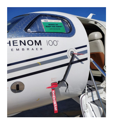
Phenom 100 (EMB 500) Pitot Cover/AOA Set