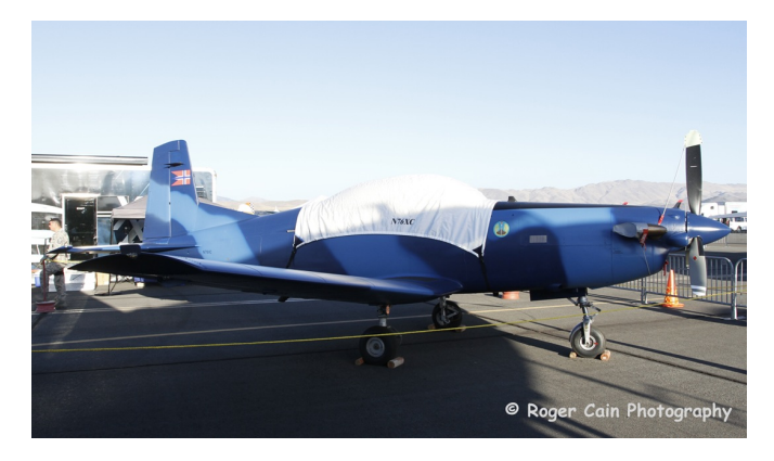
Pilatus PC-7 Canopy Cover

Travel Covers are made with Silver Solution-Dyed Polyester fabric and only lined over the windshield to save weight. The material is lightweight and more compact for easy stowage in the aircraft. The polyester material is water resistant, but only intended for occasional use outside. We also have an ultra lightweight material available for fitted hangar dust covers. For daily outdoor use, the non-travel Sunbrella Cover is the best choice.