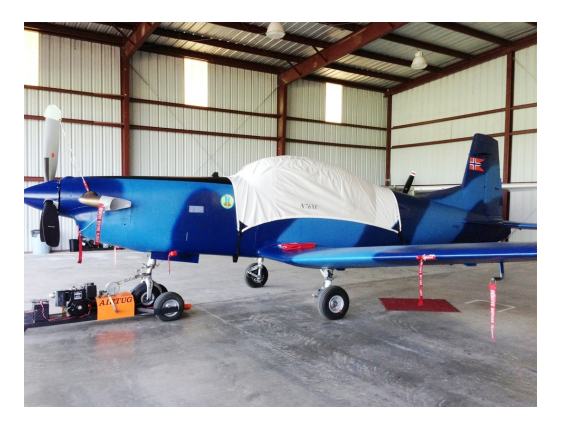
Pilatus PC-7 Canopy Cover