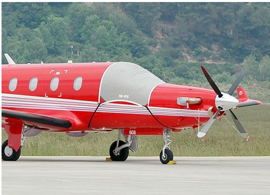
Pilatus PC-12 Windshield Cover

This cover type is made from Silver Acrylic Sunbrella canvas and is 100% lined with a soft and smooth microfiber. Bruce's Custom Covers developed this material combination especially for aircraft protection. The outer material is medium weight and treated for water resistance, UV resistance and anti-static buildup. The inner lining is a very soft and smooth microfiber to prevent scratching. The material is very reflective, and tests show that the cabin interior temperature can be reduced to near-ambient temperature on the hottest of days. It is water, ice and snow repellent, yet breathable to allow moisture to escape from between the cover and the aircraft surface.