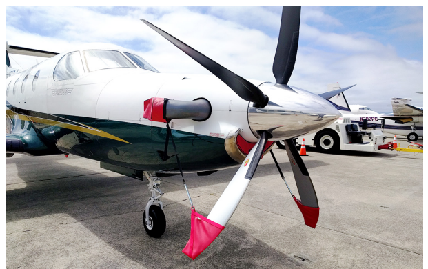
Main Intake Plug and Prop-Tie/Exhaust Covers. (Sold Separately)