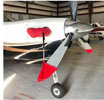
WH6 Harpoon Exhaust Covers/Prop Tie