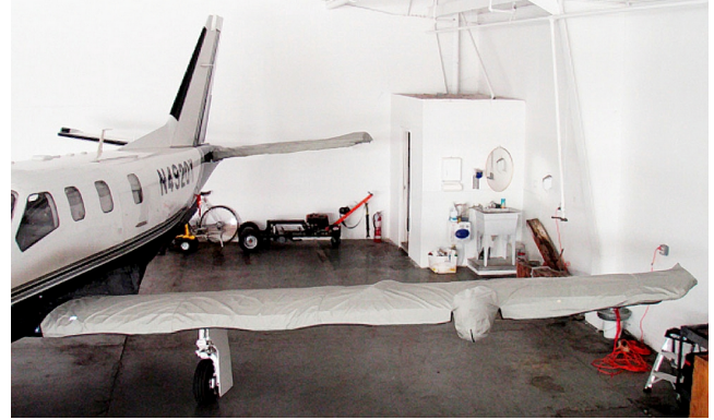
Socata TBM 700, 850 Wing and Horizontal Stabilizer Covers