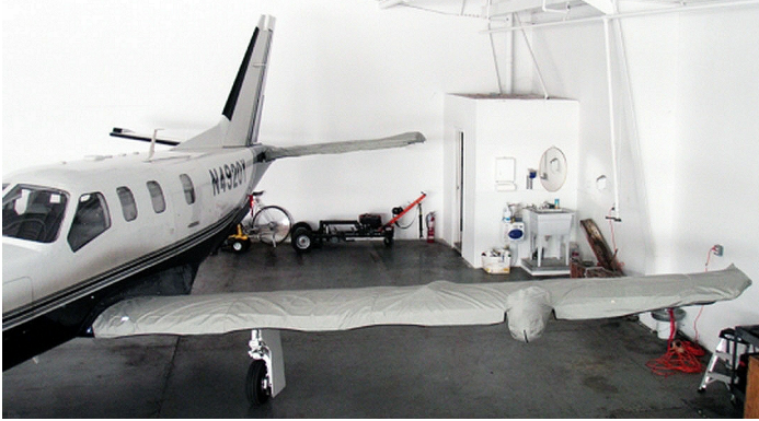
Pilatus PC-12 Wing Covers

WINTER USE MATERIAL - Made with Solution-Dyed Polyester fabric, this option is intended for seasonal use to aid in deicing, rain mitigation, or for occasional travel. The material is lighter and more compact, but more susceptible to UV damage and may have a shorter useful life if used continuously outside than the all-year use material.