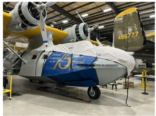
Consolidated Vultee PBY Cockpit/Nose Cover