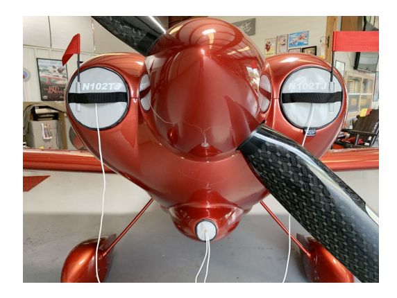
ENGINE PLUGS PREVENT BIRD NEST FOD. Piper Saratoga Engine Cowling Bird's SPA Sport Panther LS Engine Plugs, set of Nest 3