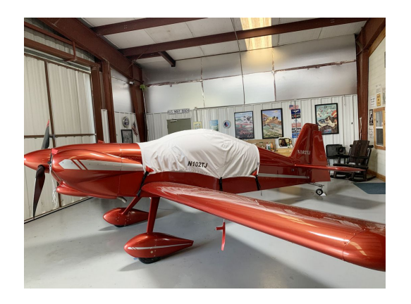
SPA Sport Panther Canopy Cover