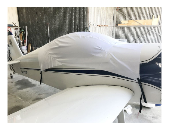
SPA, Sport Performance Aviation, Panther Canopy Cover (test fit cover)

non-travel Sunbrella Cover is the best choice.