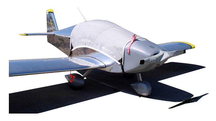
Sonex Canopy Cover

This cover type is made from Silver Acrylic Sunbrella canvas and is 100% lined with a soft and smooth microfiber. Bruce's Custom Covers developed this material combination especially for aircraft protection. The outer material is medium weight and treated for water resistance, UV resistance and anti-static buildup. The inner lining is a very soft and smooth microfiber to prevent scratching. The material is very reflective, and tests show that the cabin interior temperature can be reduced to near-ambient temperature on the hottest of days. It is water, ice and snow repellent, yet breathable to allow moisture to escape from between the cover and the aircraft surface.