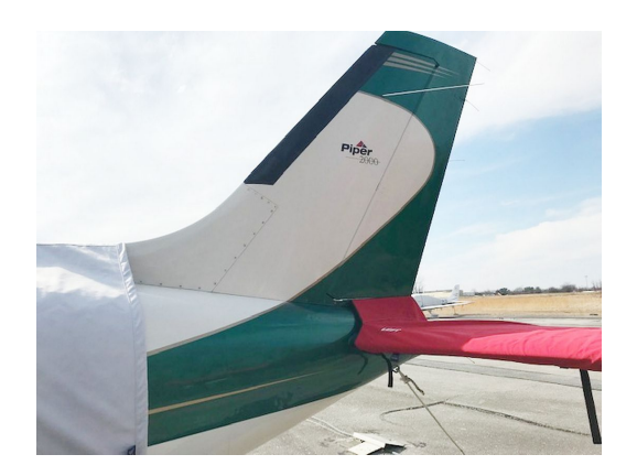
Piper Malibu/Mirage Horizontal Stabilizer/Tailcone Cover

WINTER USE MATERIAL - Made with Solution-Dyed Polyester fabric, this option is intended for seasonal use to aid in deicing, rain mitigation, or for occasional travel. The material is lighter and more compact, but more susceptible to UV damage and may have a shorter useful life if used continuously outside than the all-year use material.