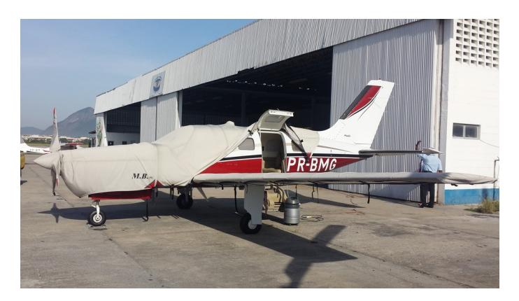
Piper Malibu/Mirage Extended Canopy Cover, Engine, Prop & Wing Covers