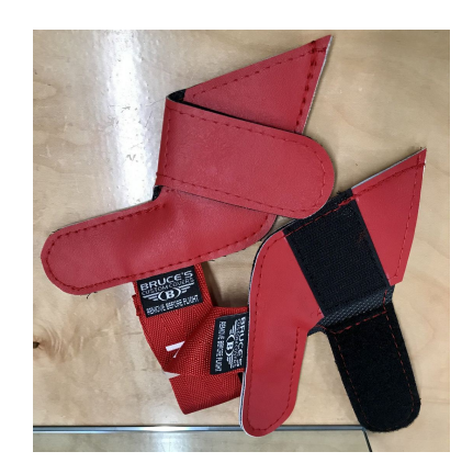
Piper PA-46-600TP M600 Pitot Covers, Heat Resistant Type, M600 Model Only

Engine Inlet Plugs are custom fit for your Piper PA-46 Malibu intakes, made with heavy-duty vinyl material, and stuffed with a single block of sculpted urethane foam. Each plug has a zipper that allows the foam to be removed and dried if necessary. Engine plugs have warning flags that are visible from the cockpit or 'remove before flight' streamers sewn onto the face of the plugs. Most plugs are imprinted with the aircraft registration number in black for an extra charge. Storage bag NOT included. Engine plugs may be inserted after flight when the engine is still warm. Engine Inlet Plugs are commonly referred to as Cowl Plugs, Intake Plugs, Cowl Blocks, Engine Blocks, and Engine Bungs.