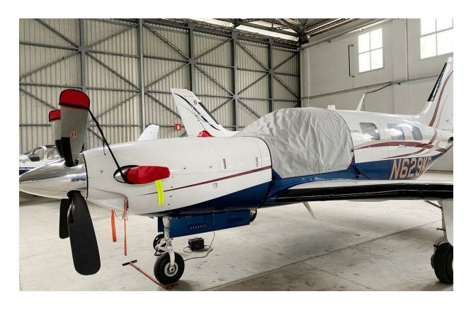
Piper PA-46-500TP Engine Cowling Top Plug