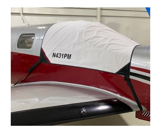
Piper Meridian Cockpit Cover

This cover type is made from Silver Acrylic Sunbrella canvas and is 100% lined with a soft and smooth microfiber. Bruce's Custom Covers developed this material combination especially for aircraft protection. The outer material is medium weight and treated for water resistance, UV resistance and anti-static buildup. The inner lining is a very soft and smooth microfiber to prevent scratching. The material is very reflective, and tests show that the cabin interior temperature can be reduced to near-ambient temperature on the hottest of days. It is water, ice and snow repellent, yet breathable to allow moisture to escape from between the cover and the aircraft surface.