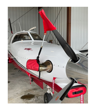
Piper Malibu JetProp Plugs, Prop Tie, Exhaust Covers