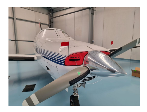
Piper PA-46 Malibu Engine Inlet Plugs

Heatshields are interior sunshades for an aircraft's windows or canopy glass. The product is a unique composite of closed-cell foam with a silver mylar finish. The semi-rigid design is stiff enough to stand along the inside of the windshield using sun visors or window framing. It folds up flat and easily stores in the included storage sleeve. Some designs may require velcro and suction cups. A Heatshield is an excellent short-term remedy for cockpit overheating.