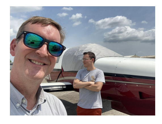
Piper Malibu/Mirage Cockpit Cover