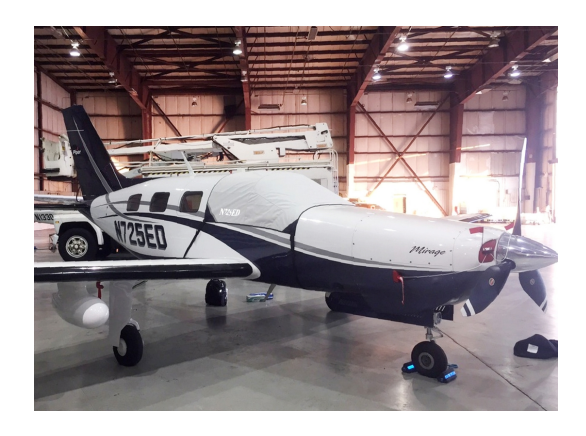
Piper Malibu/Mirage Cockpit Cover, Engine Plugs