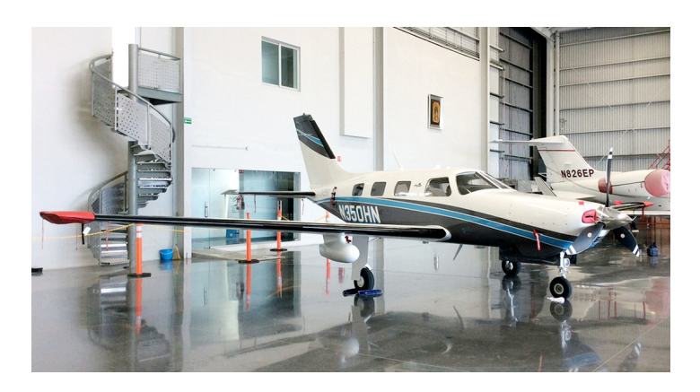
Piper PA-46 Malibu Wingtip Pads

Designed to prevent damage to the aircraft extremities in crowded hangars, these products are made of bright red Naugahyde and thickly padded with a sandwich of closed cell foam.