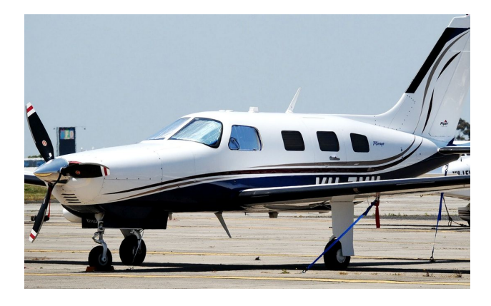
Piper PA-46-350P Mirage, Matrix, JetProp Cockpit Heatshields