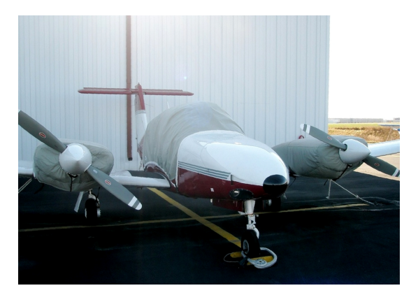
Piper Seminole Canopy and Engine Covers