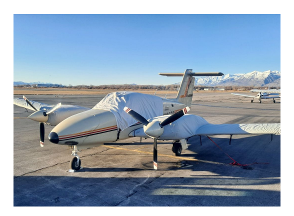
Piper PA-44 Wing/Engine Covers, Canopy Cover

WINTER USE MATERIAL - Made with Solution-Dyed Polyester fabric, this option is intended for seasonal use to aid in deicing, rain mitigation, or for occasional travel. The material is lighter and more compact, but more susceptible to UV damage and may have a shorter useful life if used continuously outside than the all-year use material.