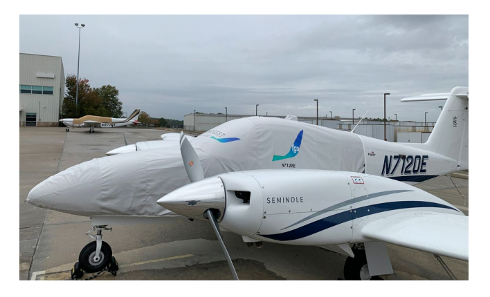
Piper PA-44 Seminole Canopy/Nose Cover with custom artwork