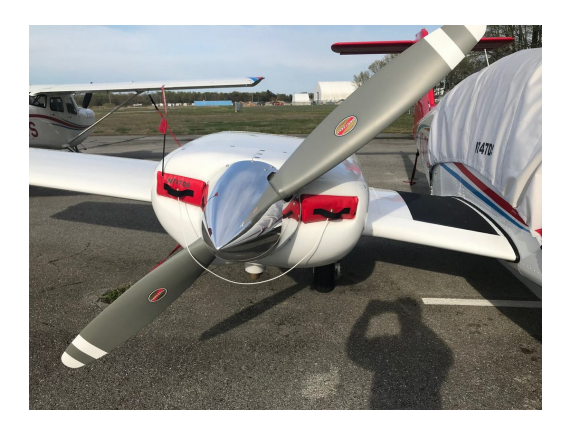
Piper Seminole Engine Plugs