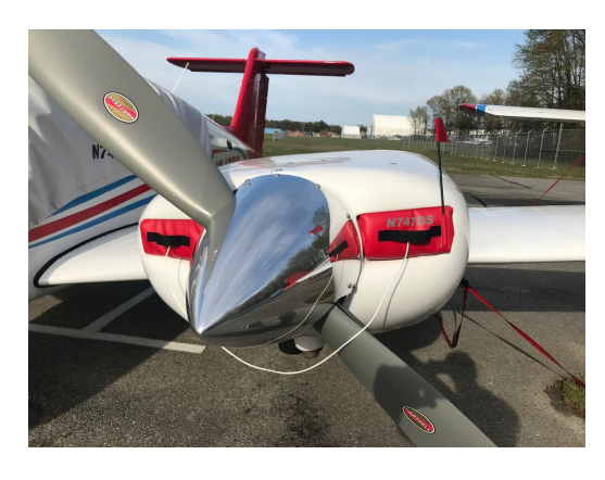
Piper Seminole Engine Plugs