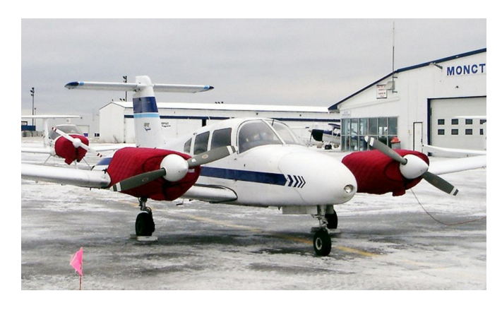
Piper Seminole Insulated Engine Covers