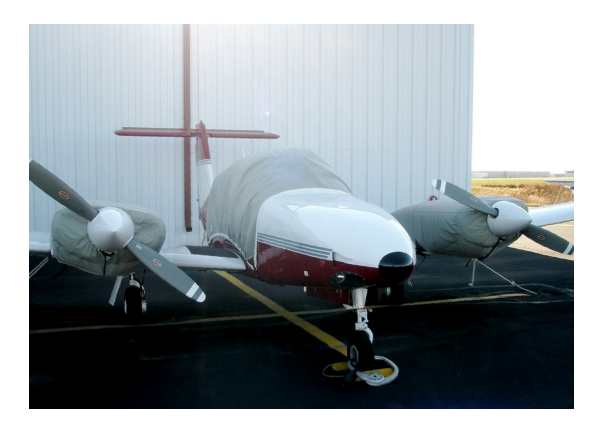
Piper Seminole Canopy and Engine Covers