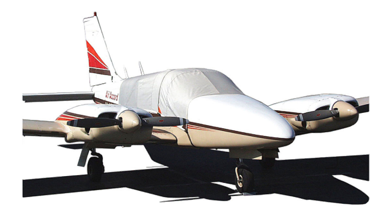
Piper Seneca PA-34 Canopy Cover

Travel Covers are made with Silver Solution-Dyed Polyester fabric and only lined over the windshield to save weight. The material is lightweight and more compact for easy stowage in the aircraft. The polyester material is water resistant, but only intended for occasional use outside. We also have an ultra lightweight material available for fitted hangar dust covers. For daily outdoor use, the non-travel Sunbrella Cover is the best choice.