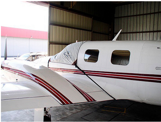
Piper Cheyenne Cockpit Cover

This cover type is made from Silver Acrylic Sunbrella canvas and is 100% lined with a soft and smooth microfiber. Bruce's Custom Covers developed this material combination especially for aircraft protection. The outer material is medium weight and treated for water resistance, UV resistance and anti-static buildup. The inner lining is a very soft and smooth microfiber to prevent scratching. The material is very reflective, and tests show that the cabin interior temperature can be reduced to near-ambient temperature on the hottest of days. It is water, ice and snow repellent, yet breathable to allow moisture to escape from between the cover and the aircraft surface.