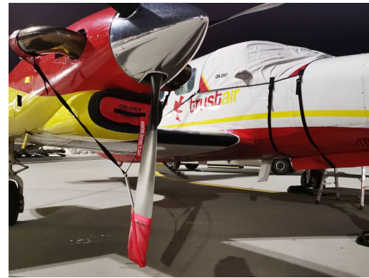
Piper PA-42 Cheyenne III Prop Tie/Exhaust Cover, Inlet Plugs