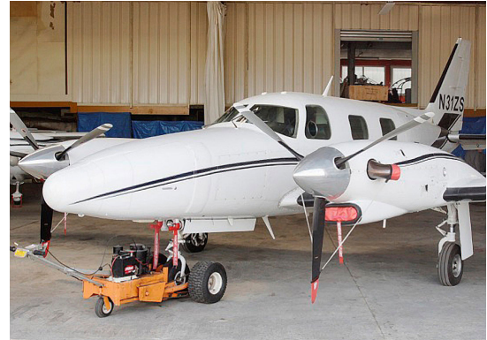
Piper PA-42 Cheyenne III Engine Plugs, Prop Ties, Cockpit Cover Piper Cheyenne IIXL Prop Tie/Exhaust Covers, Intake Plugs