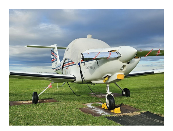
Piper PA-38 Tomahawk Canopy Cover