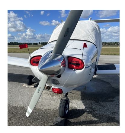
PA-38 Tomahawk Engine Inlet Plugs, Includes Carb. Inlet Plug Set of 3)