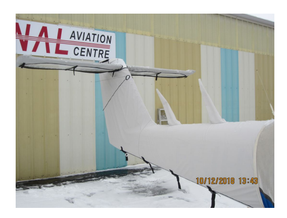
Piper PA-38 Tomahawk Empennage Cover (Tailboom, Vertical & Horiz Stabilizers) Set (W/Horiz. Stab. Cover), Winter Use

WINTER USE MATERIAL - Made with Solution-Dyed Polyester fabric, this option is intended for seasonal use to aid in deicing, rain mitigation, or for occasional travel. The material is lighter and more compact, but more susceptible to UV damage and may have a shorter useful life if used continuously outside than the all-year use material.