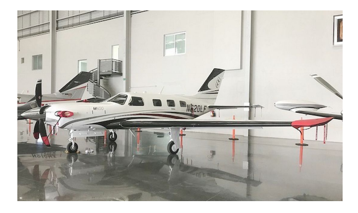
Piper Meridian Wingtip Pads, M600 Models