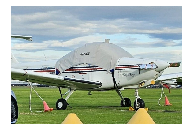
Piper PA-38 Tomahawk Canopy Cover

This cover type is made from Silver Acrylic Sunbrella canvas and is 100% lined with a soft and smooth microfiber. Bruce's Custom Covers developed this material combination especially for aircraft protection. The outer material is medium weight and treated for water resistance, UV resistance and anti-static buildup. The inner lining is a very soft and smooth microfiber to prevent scratching. The material is very reflective, and tests show that the cabin interior temperature can be reduced to near-ambient temperature on the hottest of days. It is water, ice and snow repellent, yet breathable to allow moisture to escape from between the cover and the aircraft surface.