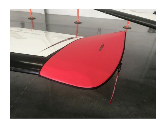
Piper Meridian Wingtip Pads, M600 Models