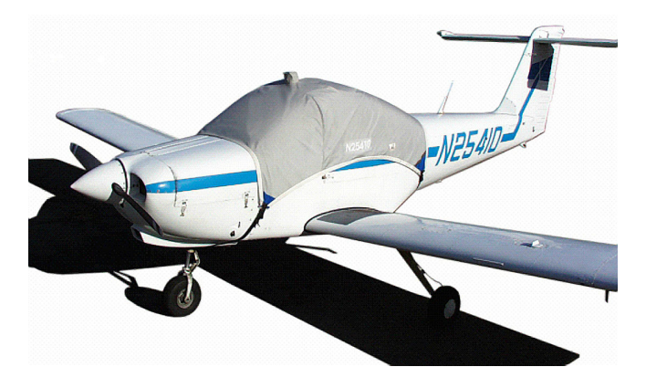
Piper Tomahawk Canopy Cover

Travel Covers are made with Silver Solution-Dyed Polyester fabric and only lined over the windshield to save weight. The material is lightweight and more compact for easy stowage in the aircraft. The polyester material is water resistant, but only intended for occasional use outside. We also have an ultra lightweight material available for fitted hangar dust covers. For daily outdoor use, the non-travel Sunbrella Cover is the best choice.