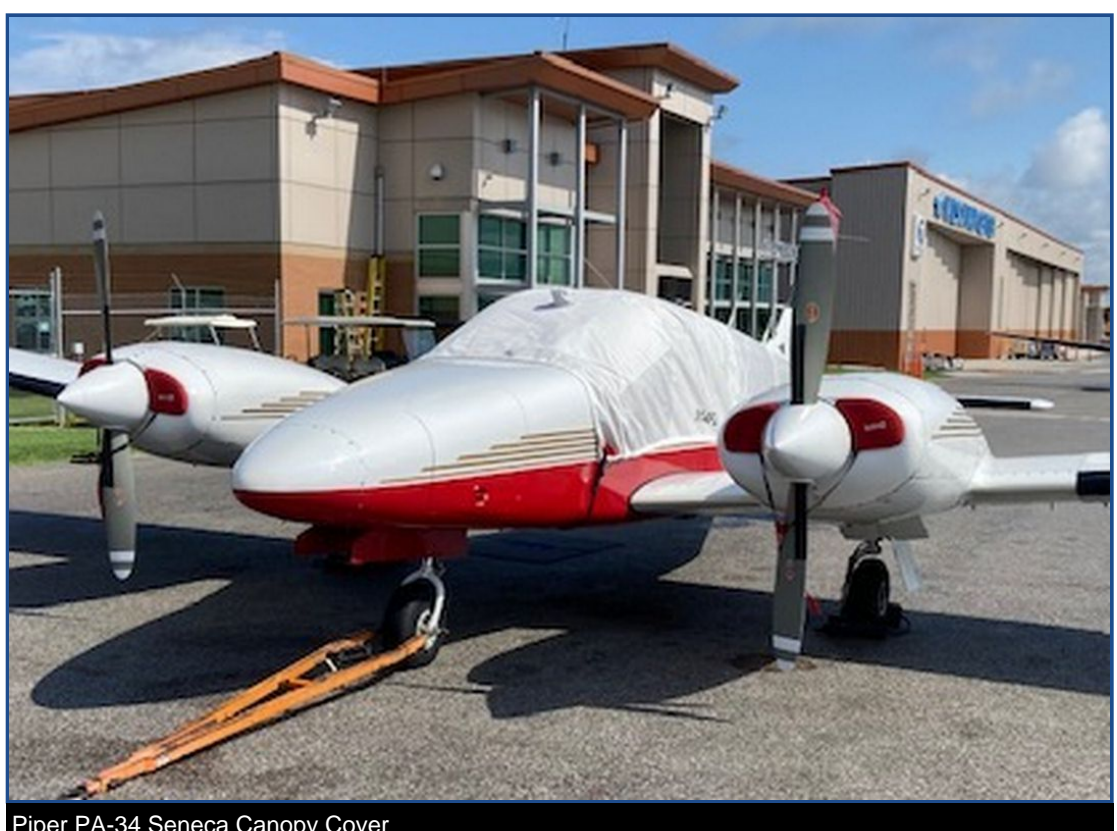
Piper PA-34 Seneca Canopy Cover