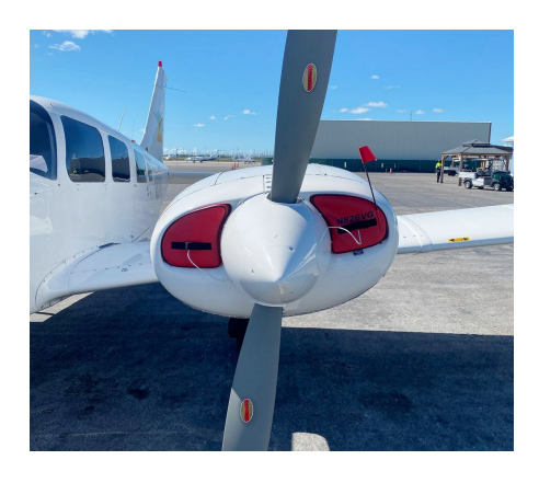
Piper PA-34-200T Engine Inlet Plugs