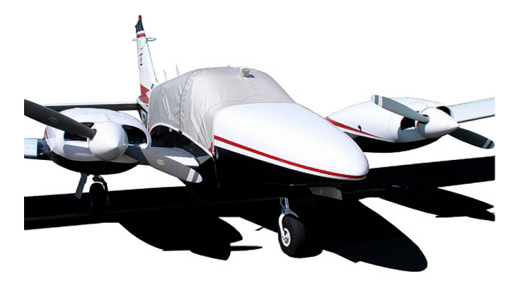
Piper Seneca Insulated Engine Covers