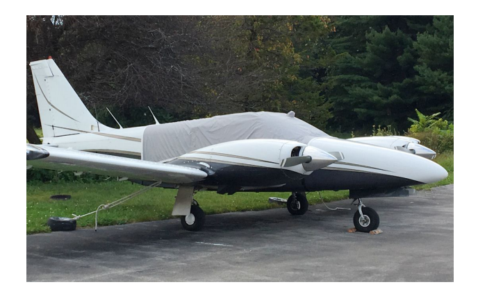
Piper Seneca Light Weight Travel Canopy Cover

Travel Covers are made with Silver Solution-Dyed Polyester fabric and only lined over the windshield to save weight. The material is lightweight and more compact for easy stowage in the aircraft. The polyester material is water resistant, but only intended for occasional use outside. We also have an ultra lightweight material available for fitted hangar dust covers. For daily outdoor use, the non-travel Sunbrella Cover is the best choice.