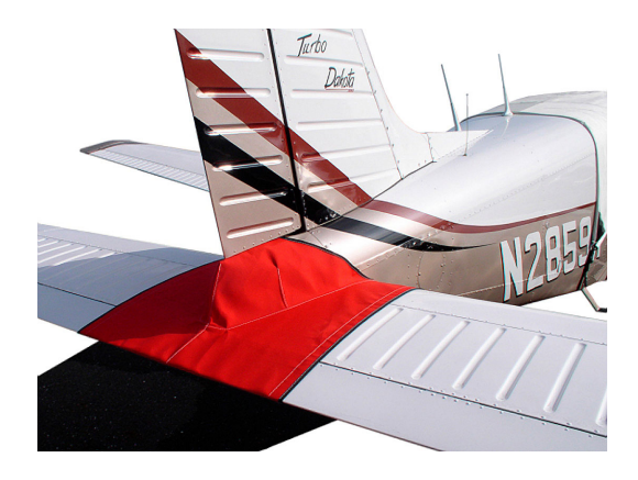
Piper PA-28 Tailcone Cover

WINTER USE MATERIAL - Made with Solution-Dyed Polyester fabric, this option is intended for seasonal use to aid in deicing, rain mitigation, or for occasional travel. The material is lighter and more compact, but more susceptible to UV damage and may have a shorter useful life if used continuously outside than the all-year use material.