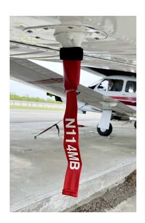
Rockwell 114 Blade Type Pitot Cover