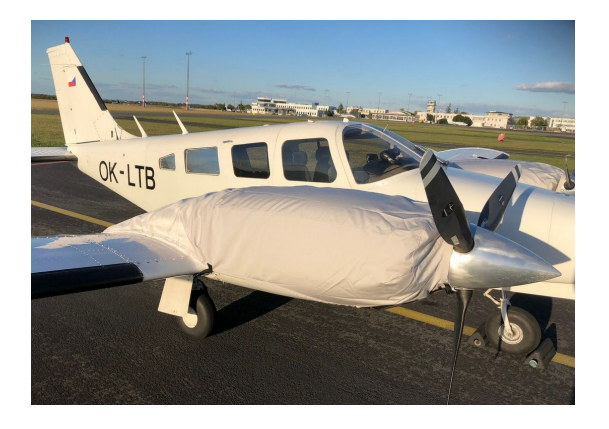
Piper PA-34 Seneca II Fully Enclosed Engine Covers