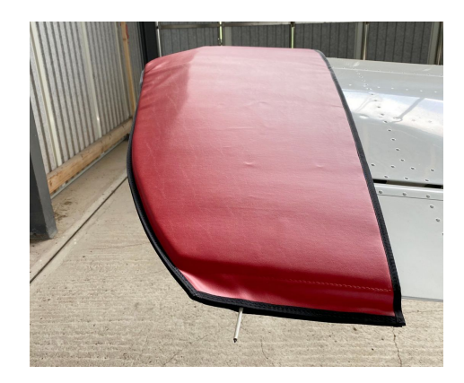
Piper PA-34 Seneca Wingtip Pads

Designed to prevent damage to the aircraft extremities in crowded hangars, these products are made of bright red Naugahyde and thickly padded with a sandwich of closed cell foam.