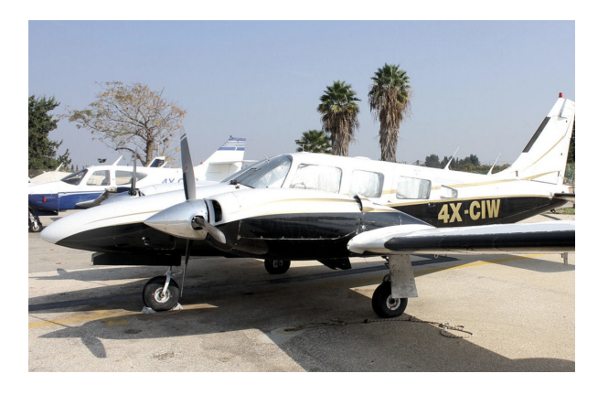
Piper Seneca Windshield & Cabin HeatShields

Windshield Heatshields are interior sunshades for an aircraft's front windshield. The product is a unique composite of closed-cell foam with a silver mylar finish. The semi-rigid design is stiff enough to stand along the inside of the windshield using sun visors or window framing. It folds up flat and easily stores in the included storage sleeve. Some designs may require velcro and suction cups or split right and left sides. A Heatshield is an excellent short-term remedy for cockpit overheating. An external fabric cover is far more effective and practical for long-term protection.