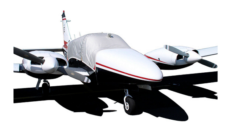
Piper Seneca Canopy Cover