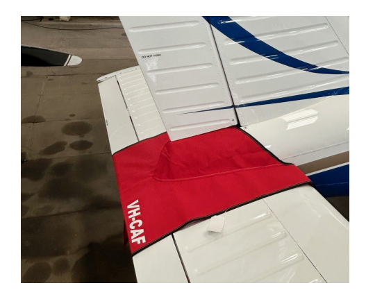
Piper PA28-180 Tailcone Cover, fully enclosed