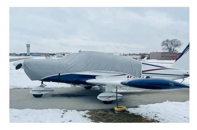
Piper PA-32-260 Travel Canopy/Engine Cover

Travel Covers are made with Silver Solution-Dyed Polyester fabric and only lined over the windshield to save weight. The material is lightweight and more compact for easy stowage in the aircraft. The polyester material is water resistant, but only intended for occasional use outside. We also have an ultra lightweight material available for fitted hangar dust covers. For daily outdoor use, the non-travel Sunbrella Cover is the best choice.