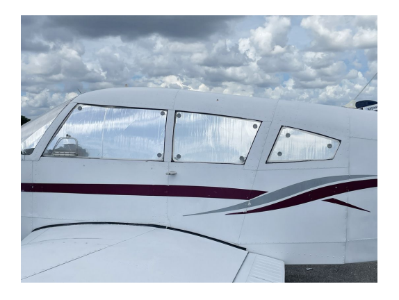
Piper PA-28R-200 Heatshield set

Windshield Heatshields are interior sunshades for an aircraft's front windshield. The product is a unique composite of closed-cell foam with a silver mylar finish. The semi-rigid design is stiff enough to stand along the inside of the windshield using sun visors or window framing. It folds up flat and easily stores in the included storage sleeve. Some designs may require velcro and suction cups or split right and left sides. A Heatshield is an excellent short-term remedy for cockpit overheating. An external fabric cover is far more effective and practical for long-term protection.