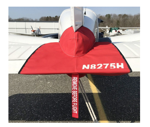
Piper PA-28 Models Tailcone Cover (Fully Enclosed)

WINTER USE MATERIAL - Made with Solution-Dyed Polyester fabric, this option is intended for seasonal use to aid in deicing, rain mitigation, or for occasional travel. The material is lighter and more compact, but more susceptible to UV damage and may have a shorter useful life if used continuously outside than the all-year use material.