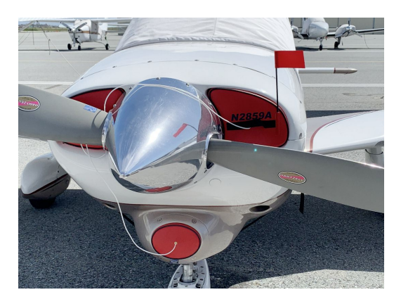
Piper Arrow Engine Plugs

Engine Inlet Plugs are custom fit for your Piper PA-28 Models intakes, made with heavy-duty vinyl material, and stuffed with a single block of sculpted urethane foam. Each plug has a zipper that allows the foam to be removed and dried if necessary. Engine plugs have warning flags that are visible from the cockpit or 'remove before flight' streamers sewn onto the face of the plugs. Most plugs are imprinted with the aircraft registration number in black for an extra charge. Storage bag NOT included. Engine plugs may be inserted after flight when the engine is still warm. Engine Inlet Plugs are commonly referred to as Cowl Plugs, Intake Plugs, Cowl Blocks, Engine Blocks, and Engine Bungs.