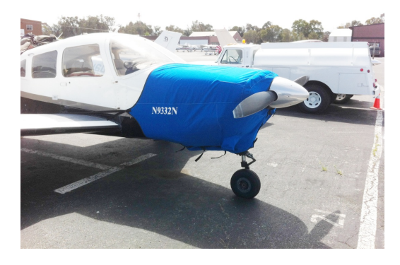
Piper PA-28-180 Insulated Engine Cover with Oil Filler Preheater Access and Inlet Preheater Access Ports Flaps