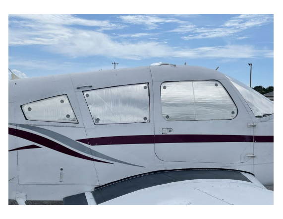
Piper PA-28R-200 Heatshield set