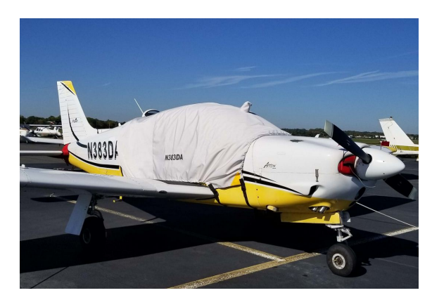
Piper PA-28 Arrow Extended Canopy Cover, Engine Plugs