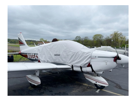
Piper PA28-181 Extended Canopy Cover w/10" fwd extension

This cover type is made from Silver Acrylic Sunbrella canvas and is 100% lined with a soft and smooth microfiber. Bruce's Custom Covers developed this material combination especially for aircraft protection. The outer material is medium weight and treated for water resistance, UV resistance and anti-static buildup. The inner lining is a very soft and smooth microfiber to prevent scratching. The material is very reflective, and tests show that the cabin interior temperature can be reduced to near-ambient temperature on the hottest of days. It is water, ice and snow repellent, yet breathable to allow moisture to escape from between the cover and the aircraft surface.