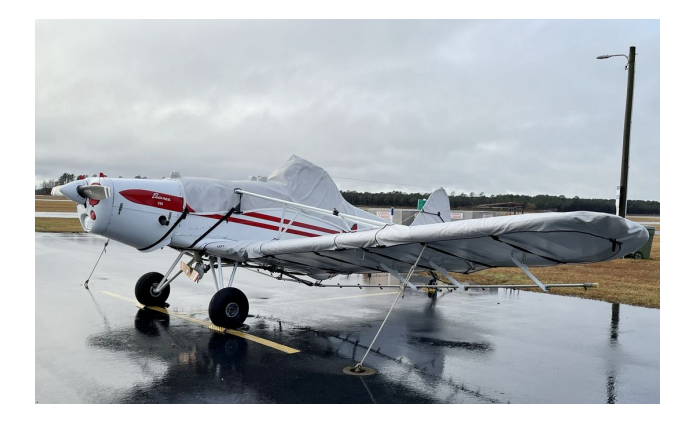
Piper Pawnee Canopy/Hopper, Wing & Empennage Covers

WINTER USE MATERIAL - Made with Solution-Dyed Polyester fabric, this option is intended for seasonal use to aid in deicing, rain mitigation, or for occasional travel. The material is lighter and more compact, but more susceptible to UV damage and may have a shorter useful life if used continuously outside than the all-year use material.