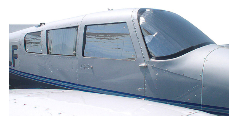
Piper Comanche HeatShield Set

Windshield Heatshields are interior sunshades for an aircraft's front windshield. The product is a unique composite of closed-cell foam with a silver mylar finish. The semi-rigid design is stiff enough to stand along the inside of the windshield using sun visors or window framing. It folds up flat and easily stores in the included storage sleeve. Some designs may require velcro and suction cups or split right and left sides. A Heatshield is an excellent short-term remedy for cockpit overheating. An external fabric cover is far more effective and practical for long-term protection.