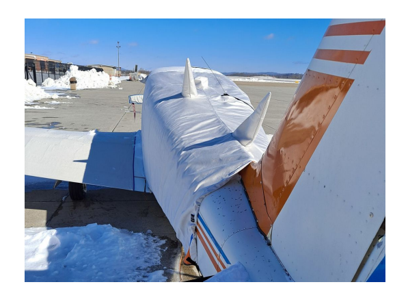
Piper PA-24 Comanche Extra Extended Canopy Cover

This cover type is made from Silver Acrylic Sunbrella canvas and is 100% lined with a soft and smooth microfiber. Bruce's Custom Covers developed this material combination especially for aircraft protection. The outer material is medium weight and treated for water resistance, UV resistance and anti-static buildup. The inner lining is a very soft and smooth microfiber to prevent scratching. The material is very reflective, and tests show that the cabin interior temperature can be reduced to near-ambient temperature on the hottest of days. It is water, ice and snow repellent, yet breathable to allow moisture to escape from between the cover and the aircraft surface.