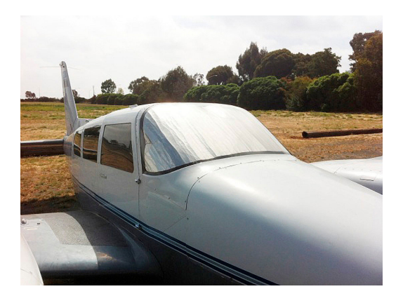
Piper Comanche Windshield HeatShield