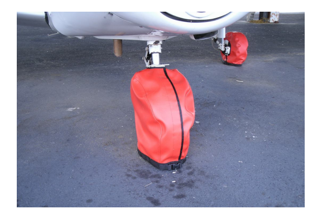
Piper PA28-140 Tire Covers

ALL-YEAR USE MATERIAL - Made with Silver Acrylic Sunbrella canvas, the all-year use material is the best option for sun protection and cover longevity. This heavier more durable material is intended for all weather conditions, such as rain and snow or lots of sun.