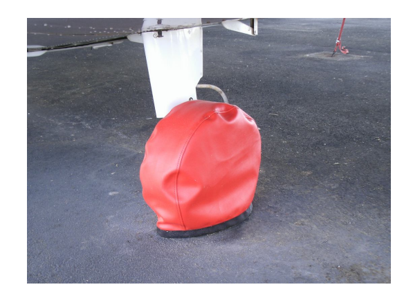
Piper PA28-140 Tire Covers