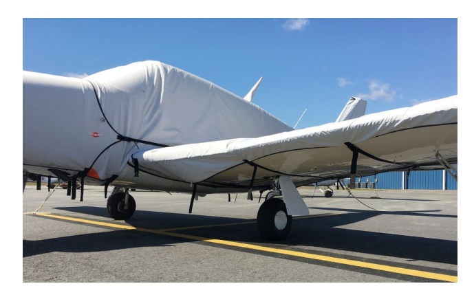
Piper PA-24 Comanche Full Cover Set

WINTER USE MATERIAL - Made with Solution-Dyed Polyester fabric, this option is intended for seasonal use to aid in deicing, rain mitigation, or for occasional travel. The material is lighter and more compact, but more susceptible to UV damage and may have a shorter useful life if used continuously outside than the all-year use material.