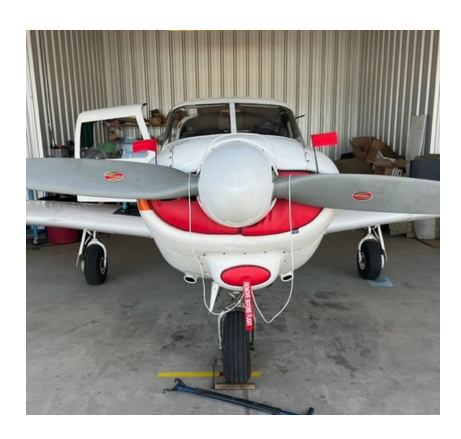
PA-24 Comanche Engine Inlet & Carb Inlet Plugs