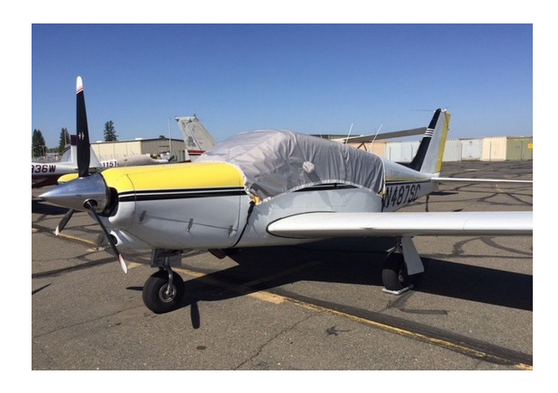
Piper PA-24 Comanche Travel Cover, Light Weight Travel Canopy Cover