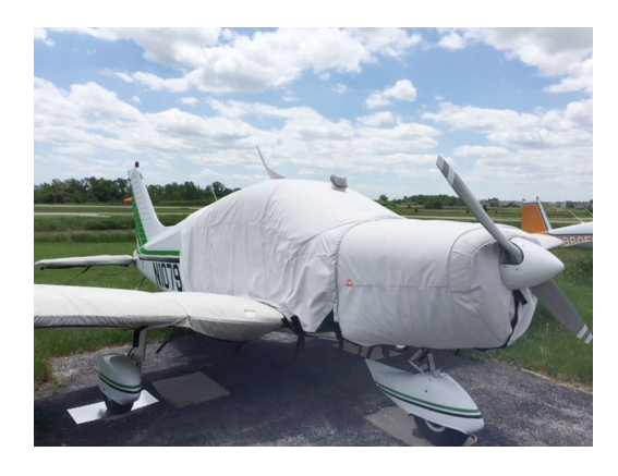
Piper PA28-140 Hail Protection Extended Canopy Cover