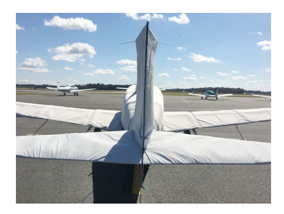
Piper PA-24 Comanche Full Cover Set