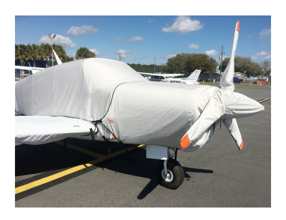
Piper PA-24 Comanche Full Cover Set