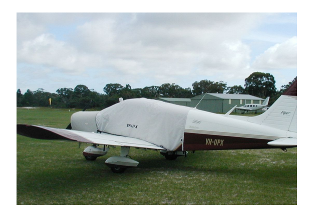
Piper PA-28 Extended Canopy Cover & Engine Cover