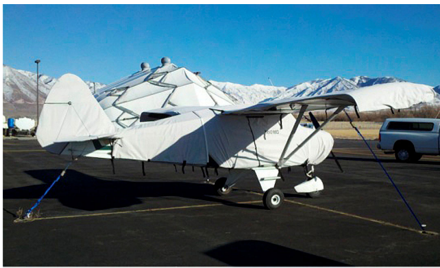
Engine, Extended Over-the-top Canopy, Wing and Empennage Covers