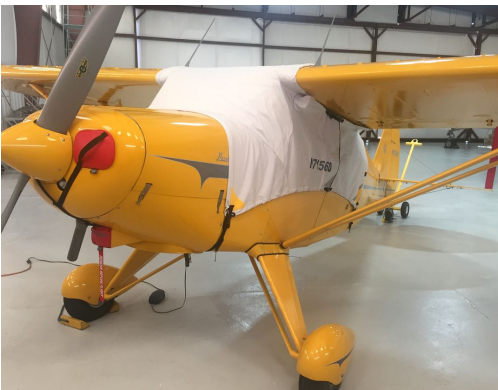
Piper Pacer Over-Top Canopy Cover

This cover type is made from Silver Acrylic Sunbrella canvas and is 100% lined with a soft and smooth microfiber. Bruce's Custom Covers developed this material combination especially for aircraft protection. The outer material is medium weight and treated for water resistance, UV resistance and anti-static buildup. The inner lining is a very soft and smooth microfiber to prevent scratching. The material is very reflective, and tests show that the cabin interior temperature can be reduced to near-ambient temperature on the hottest of days. It is water, ice and snow repellent, yet breathable to allow moisture to escape from between the cover and the aircraft surface.