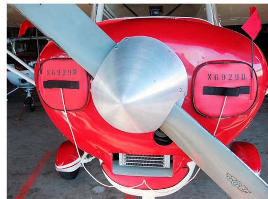
Piper PA-22-150 Engine Inlet Plugs (set of 3)