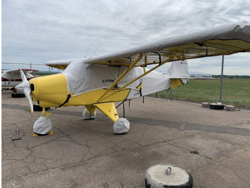
Piper PA-22 Tri-Pacer Cover Set

ALL-YEAR USE MATERIAL - Made with Silver Acrylic Sunbrella canvas, the all-year use material is the best option for sun protection and cover longevity. This heavier more durable material is intended for all weather conditions, such as rain and snow or lots of sun.