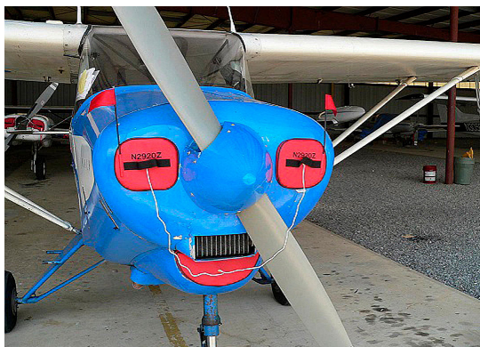
Piper PA-22-150 Engine Inlet Plugs (set of 3)

Engine Inlet Plugs are custom fit for your Piper Clipper, Pacer, Tri-Pacer, Vagabond, Colt: PA-15, 16, 20, 22 intakes, made with heavy-duty vinyl material, and stuffed with a single block of sculpted urethane foam. Each plug has a zipper that allows the foam to be removed and dried if necessary. Engine plugs have warning flags that are visible from the cockpit or 'remove before flight' streamers sewn onto the face of the plugs. Most plugs are imprinted with the aircraft registration number in black for an extra charge. Storage bag NOT included. Engine plugs may be inserted after flight when the engine is still warm. Engine Inlet Plugs are commonly referred to as Cowl Plugs, Intake Plugs, Cowl Blocks, Engine Blocks, and Engine Bunges.