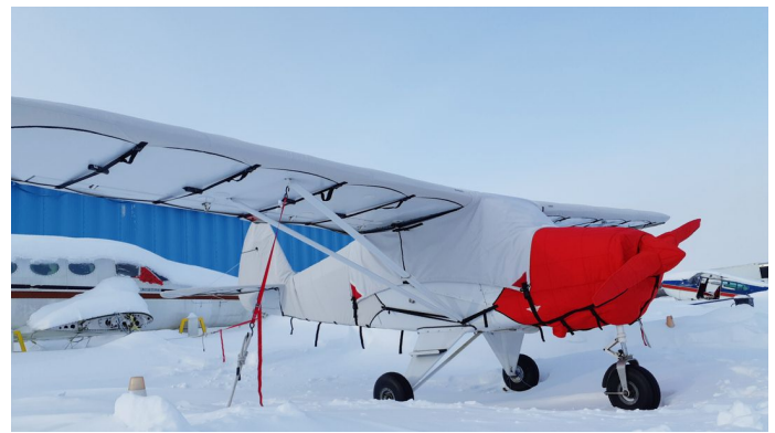
1957 PA-22-150 Over the Top Style Canopy Cover