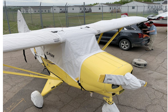
Piper PA-22 Tri-Pacer Cover Set