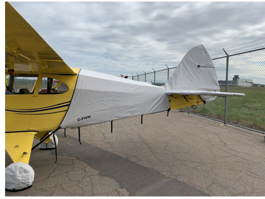
Piper PA-22 Tri-Pacer Empennage Cover