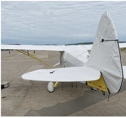
Piper PA-22 Tri-Pacer Empennage Cover