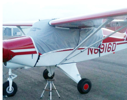
Piper PA-20 Extended Canopy Cover, Wing Covers Piper Pacer Travel Cover, Light Weight Travel Canopy Cover (Wrap-Around)