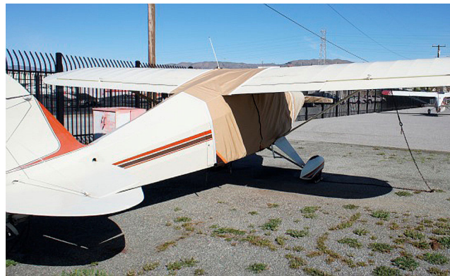
Piper PA-22-150 Pacer Extended Canopy, Engine & Prop/Spinner Covers