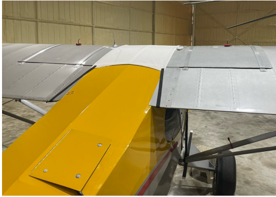
Piper J5A Windshield/Skylight Cover, test fit

This cover type is made from Silver Acrylic Sunbrella canvas and is 100% lined with a soft and smooth microfiber. Bruce's Custom Covers developed this material combination especially for aircraft protection. The outer material is medium weight and treated for water resistance, UV resistance and anti-static buildup. The inner lining is a very soft and smooth microfiber to prevent scratching. The material is very reflective, and tests show that the cabin interior temperature can be reduced to near-ambient temperature on the hottest of days. It is water, ice and snow repellent, yet breathable to allow moisture to escape from between the cover and the aircraft surface.