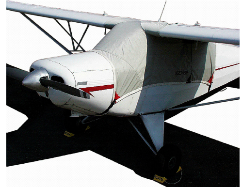
Sportsman 2+2 Wag Aero Light Weight Over the Top Travel Canopy Cover Piper PA-12 Super Cruiser Over-Top Canopy Cover