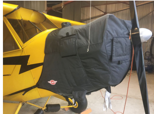
Piper J3 Cub Insulated Engine Cover