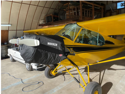
Piper PA-11 Replica Insulated Engine Cover

This cover type is made from Silver Acrylic Sunbrella canvas and is 100% lined with a soft and smooth microfiber. Bruce's Custom Covers developed this material combination especially for aircraft protection. The outer material is medium weight and treated for water resistance, UV resistance and anti-static buildup. The inner lining is a very soft and smooth microfiber to prevent scratching. The material is very reflective, and tests show that the cabin interior temperature can be reduced to near-ambient temperature on the hottest of days. It is water, ice and snow repellent, yet breathable to allow moisture to escape from between the cover and the aircraft surface.