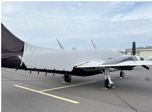
Piper PA-601 Aerostar Fuselage Cover (back to Horiz Stab)

The Piper PA-601 Aerostar Nose Cover is designed to cover the section of the fuselage forward of the windshield to the tip of the nose. It is secured with belly straps. This cover type is made from Silver Acrylic Sunbrella canvas and is 100% lined with a soft and smooth microfiber. Bruce's Custom Covers developed this material combination especially for aircraft protection. The outer material is medium weight and treated for water resistance, UV resistance and anti-static buildup. The inner lining is a very soft and smooth microfiber to prevent scratching. The material is very reflective, and tests show that the cabin interior temperature can be reduced to near-ambient temperature on the hottest of days. It is water, ice and snow repellent, yet breathable to allow moisture to escape from between the cover and the aircraft surface.