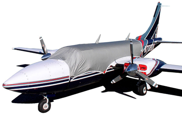
Aerostar Canopy Cover & Plugs