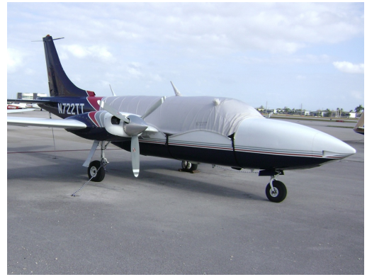
Aerostar Canopy Cover