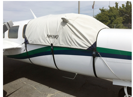
Piper PA-601 Aerostar Cockpit Cover