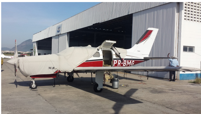
Piper Malibu/Mirage Extended Canopy Cover, Engine, Prop & Wing Covers

This cover type is made from Silver Acrylic Sunbrella canvas and is 100% lined with a soft and smooth microfiber. Bruce's Custom Covers developed this material combination especially for aircraft protection. The outer material is medium weight and treated for water resistance, UV resistance and anti-static buildup. The inner lining is a very soft and smooth microfiber to prevent scratching. The material is very reflective, and tests show that the cabin interior temperature can be reduced to near-ambient temperature on the hottest of days. It is water, ice and snow repellent, yet breathable to allow moisture to escape from between the cover and the aircraft surface.