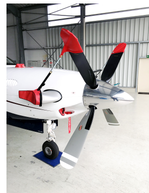
Piper PA-46-500TP PropTie/Exhaust Cover Set