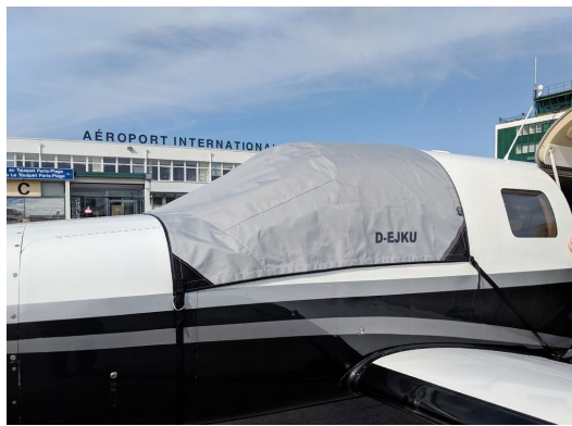
Piper PA46-350P Malibu Mirage Travel Cockpit Cover