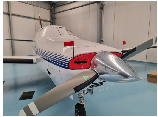
Piper PA-46 Malibu Engine Inlet Plugs