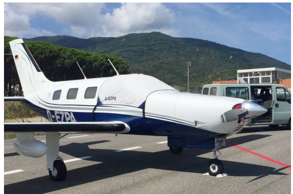
Piper Mirage PA-46-35OP Cockpit Cover