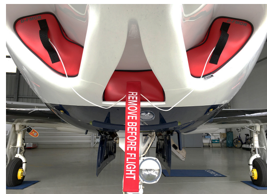
Piper PA-46-500TP Engine Inlet Plugs