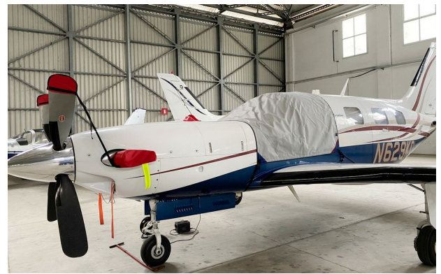
Piper PA-46-500TP Engine Cowling Top Plug