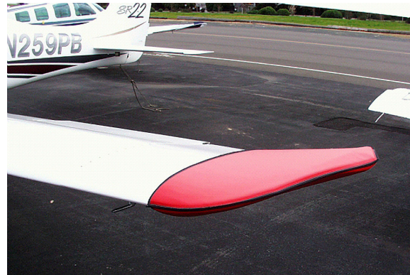
Cirrus SR-22 Wingtip Pad (also available for the Horiz. Stab.)