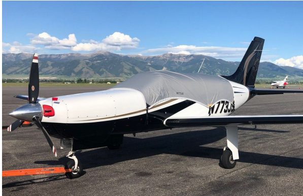
Piper PA-46 Malibu Mirage Travel Canopy Cover, Engine Plugs

Travel Covers are made with Silver Solution-Dyed Polyester fabric and only lined over the windshield to save weight. The material is lightweight and more compact for easy stowage in the aircraft. The polyester material is water resistant, but only intended for occasional use outside. We also have an ultra lightweight material available for fitted hangar dust covers. For daily outdoor use, the non-travel Sunbrella Cover is the best choice.