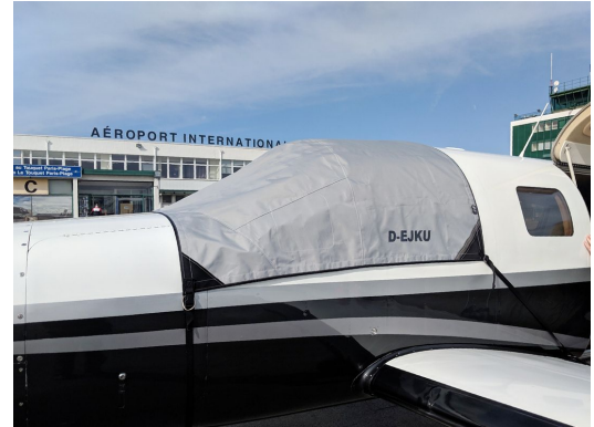
Piper PA46-350P Malibu Mirage Travel Cockpit Cover