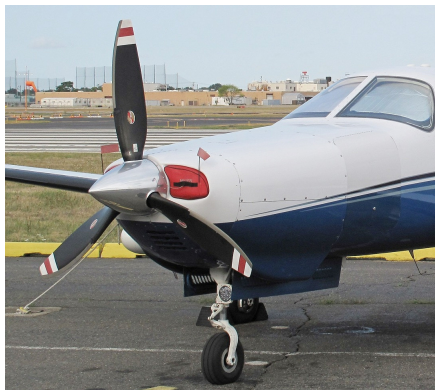
Piper Mirage Engine Plugs

Engine Inlet Plugs are custom fit for your Piper PA-46-350P Mirage, Matrix, JetProp intakes, made with heavy-duty vinyl material, and stuffed with a single block of sculpted urethane foam. Each plug has a zipper that allows the foam to be removed and dried if necessary. Engine plugs have warning flags that are visible from the cockpit or 'remove before flight' streamers sewn onto the face of the plugs. Most plugs are imprinted with the aircraft registration number in black for an extra charge. Storage bag NOT included. Engine plugs may be inserted after flight when the engine is still warm. Engine Inlet Plugs are commonly referred to as Cowl Plugs, Intake Plugs, Cowl Blocks, Engine Blocks, and Engine Bunges.