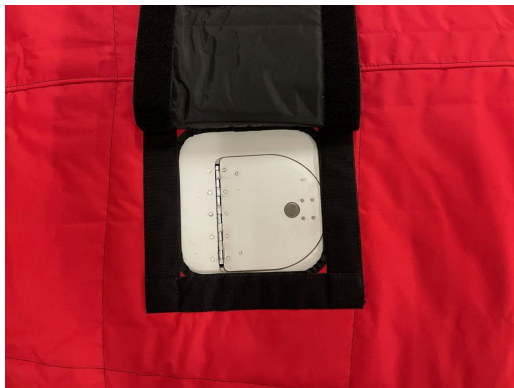
Malibu PA-46-310P Insulated Engine Cover, Oil Door Access

This cover type is made from Silver Acrylic Sunbrella canvas and is 100% lined with a soft and smooth microfiber. Bruce's Custom Covers developed this material combination especially for aircraft protection. The outer material is medium weight and treated for water resistance, UV resistance and anti-static buildup. The inner lining is a very soft and smooth microfiber to prevent scratching. The material is very reflective, and tests show that the cabin interior temperature can be reduced to near-ambient temperature on the hottest of days. It is water, ice and snow repellent, yet breathable to allow moisture to escape from between the cover and the aircraft surface.