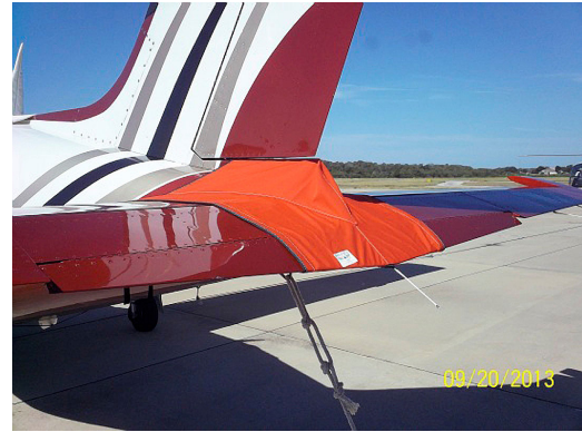
Piper Mirage, Melibu, JetProp, Meridian Tailcone Cover