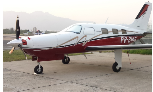
Piper Malibu/Mirage Engine Plugs, Cockpit HeatShields