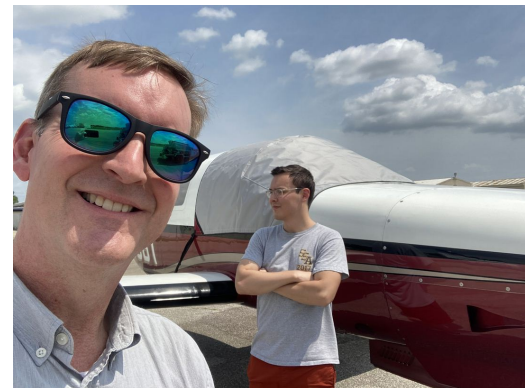
Piper Malibu/Mirage Cockpit Cover