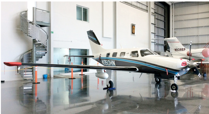
Piper PA-46 Malibu Wingtip Pads

Designed to prevent damage to the aircraft extremities in crowded hangars, these products are made of bright red Naugahyde and thickly padded with a sandwich of closed cell foam.