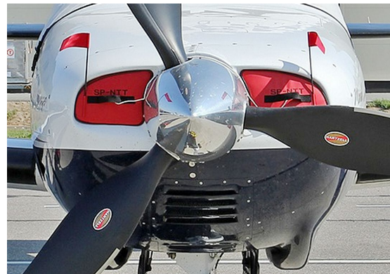
Piper PA-46-350P Mirage Engine Inlet Plugs