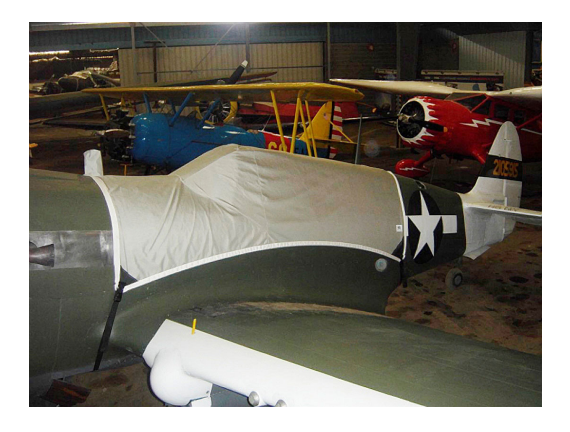
P40 Canopy Cover