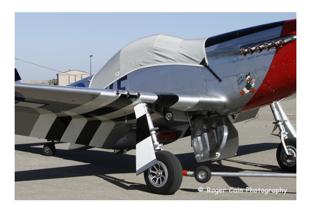
North American P-51 Canopy Cover