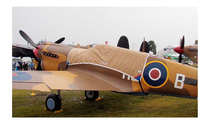
P40 Canopy Cover

Travel Covers are made with Silver Solution-Dyed Polyester fabric and only lined over the windshield to save weight. The material is lightweight and more compact for easy stowage in the aircraft. The polyester material is water resistant, but only intended for occasional use outside. We also have an ultra lightweight material available for fitted hangar dust covers. For daily outdoor use, the non-travel Sunbrella Cover is the best choice.