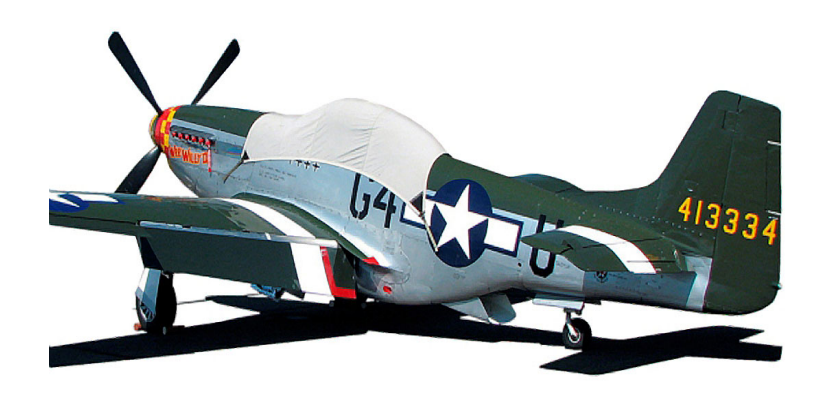
North American P51 Canopy Cover & Exhaust Plugs

Engine Inlet Plugs are custom fit for your Curtiss P40 Warhawk intakes, made with heavy-duty vinyl material, and stuffed with a single block of sculpted urethane foam. Each plug has a zipper that allows the foam to be removed and dried if necessary. Engine plugs have warning flags that are visible from the cockpit or 'remove before flight' streamers sewn onto the face of the plugs. Most plugs are imprinted with the aircraft registration number in black for an extra charge. Storage bag NOT included. Engine plugs may be inserted after flight when the engine is still warm. Engine Inlet Plugs are commonly referred to as Cowl Plugs, Intake Plugs, Cowl Blocks, Engine Blocks, and Engine Bungs.