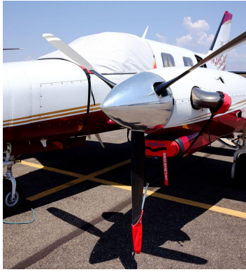
Piper Cheyenne Cockpit Cover, Engine Plugs, Prop Tie/Exhaust Covers

non-travel Sunbrella Cover is the best choice.