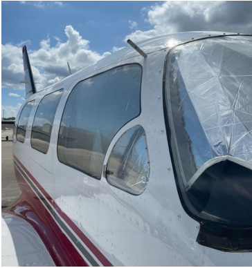
Piper PA-31 Models Cockpit HeatShields

for cockpit overheating, but an external fabric cover is more effective for long-term protection.