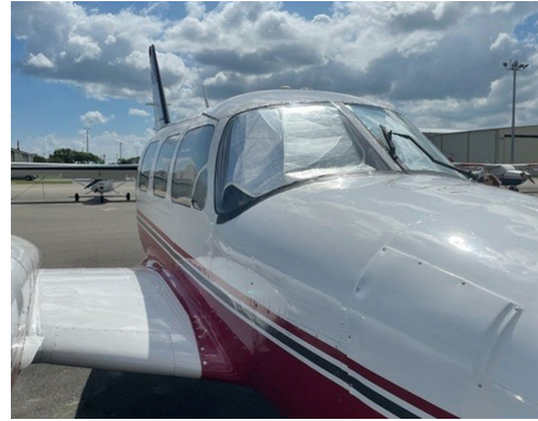
Piper PA-31 Models Cockpit HeatShields