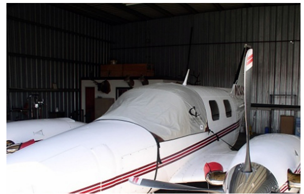
Piper Cheyenne Cockpit Cover