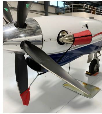
Piper PA-31T Cheyenne II Prop Tie-Downs/Exhaust Covers