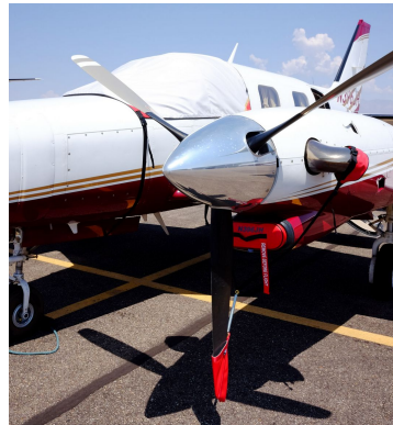
Piper Cheyenne Cockpit Cover, Engine Plugs, Prop Tie/Exhaust Covers