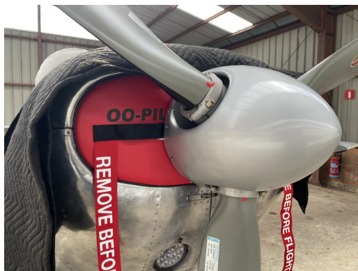
Pilatus P-3 Engine Plugs

Engine Inlet Plugs are custom fit for your Pilatus P-3 intakes, made with heavy-duty vinyl material, and stuffed with a single block of sculpted urethane foam. Each plug has a zipper that allows the foam to be removed and dried if necessary. Engine plugs have warning flags that are visible from the cockpit or 'remove before flight' streamers sewn onto the face of the plugs. Most plugs are imprinted with the aircraft registration number in black for an extra charge. Storage bag NOT included. Engine plugs may be inserted after flight when the engine is still warm. Engine Inlet Plugs are commonly referred to as Cowl Plugs, Intake Plugs, Cowl Blocks, Engine Blocks, and Engine Bungs.