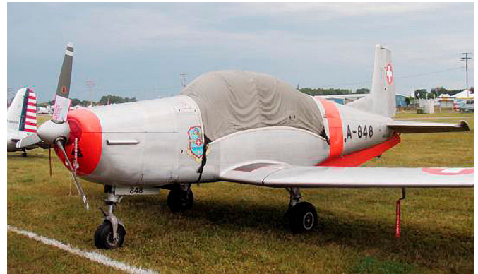
Pilatus P-3 Canopy Cover