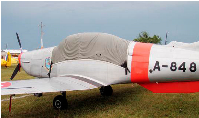
Pilatus P-3 Canopy Cover

Covers developed this material combination especially for aircraft protection. The outer material is medium weight and treated for water resistance, UV resistance and anti-static buildup. The inner lining is a very soft and smooth microfiber to prevent scratching. The material is very reflective, and tests show that the cabin interior temperature can be reduced to near-ambient temperature on the hottest of days. It is water, ice and snow repellent, yet breathable to allow moisture to escape from between the cover and the aircraft surface.