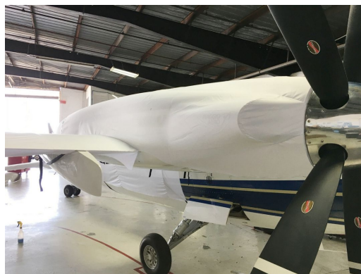
Piaggio P180 Fuselage/Canard Cover & Wing/Engine Covers (test fit covers)