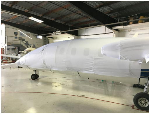
Piaggio P180 Fuselage/Canard Cover & Wing/Engine Covers (test fit covers)