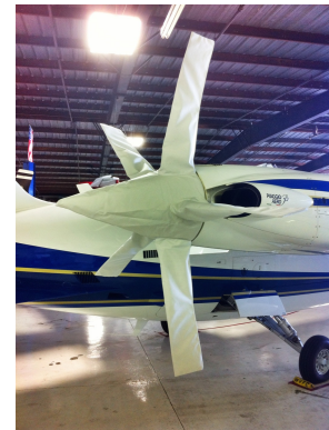
Piaggio 180 5-Blade Prop/Hub Cover