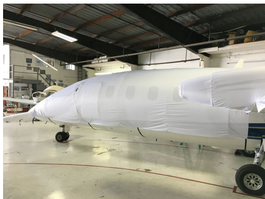
Piaggio P180 Fuselage/Canard Cover & Wing/Engine Covers (test fit covers)

WINTER USE MATERIAL - Made with Solution-Dyed Polyester fabric, this option is intended for seasonal use to aid in deicing, rain mitigation, or for occasional travel. The material is lighter and more compact, but more susceptible to UV damage and may have a shorter useful life if used continuously outside than the all-year use material.