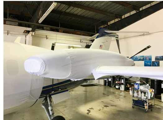
Piaggio P180 Fuselage/Canard Cover & Wing/Engine Covers (test fit covers)