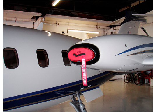
Piaggio 180 Engine Inlet Plugs