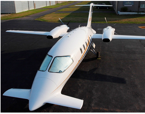
Piaggio 180 Cockpit HeatShields