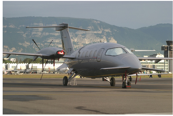
Piaggio 180 Cockpit HeatShields