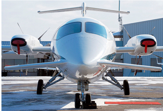
Piaggio 180 Engine Plugs

Engine Inlet Plugs are custom fit for your Piaggio Avanti P180 intakes, made with heavy-duty vinyl material, and stuffed with a single block of sculpted urethane foam. Each plug has a zipper that allows the foam to be removed and dried if necessary. Engine plugs have warning flags that are visible from the cockpit or 'remove before flight' streamers sewn onto the face of the plugs. Most plugs are imprinted with the aircraft registration number in black for an extra charge. Storage bag NOT included. Engine plugs may be inserted after flight when the engine is still warm. Engine Inlet Plugs are commonly referred to as Cowl Plugs, Intake Plugs, Cowl Blocks, Engine Blocks, and Engine Bunges.