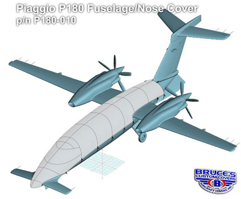
Piaggio 180 Fuselage/Nose Cover