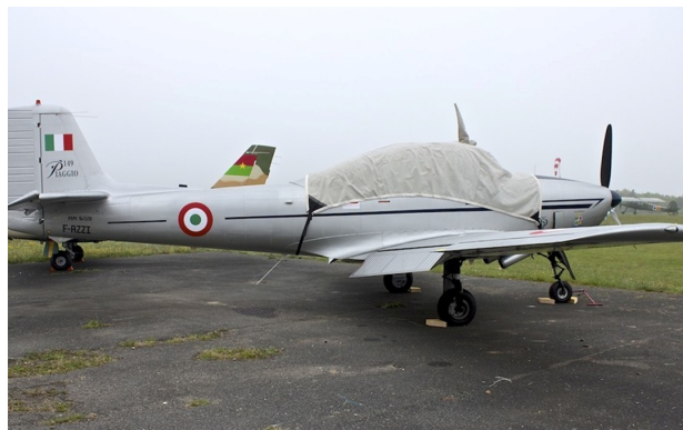
Piaggio P-149 Canopy Cover