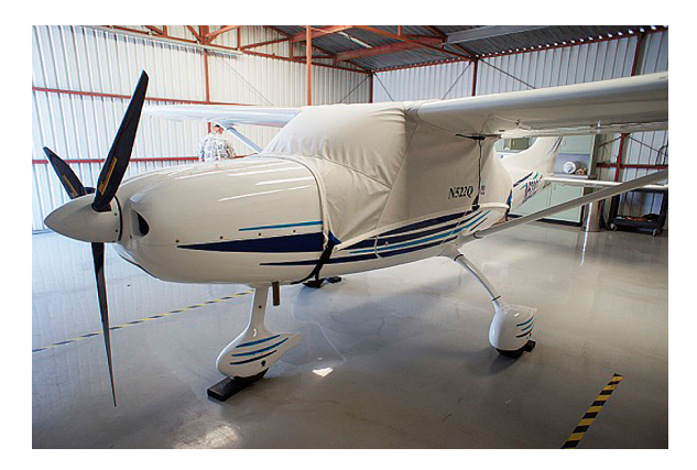
TL Ultralight Sirius Canopy Cover

the hottest of days. It is water, ice and snow repellent, yet breathable to allow moisture to escape from between the cover and the aircraft surface.