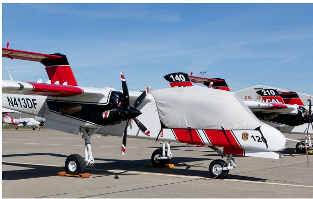
Rockwell OV-10A Bronco Cockpit Cover