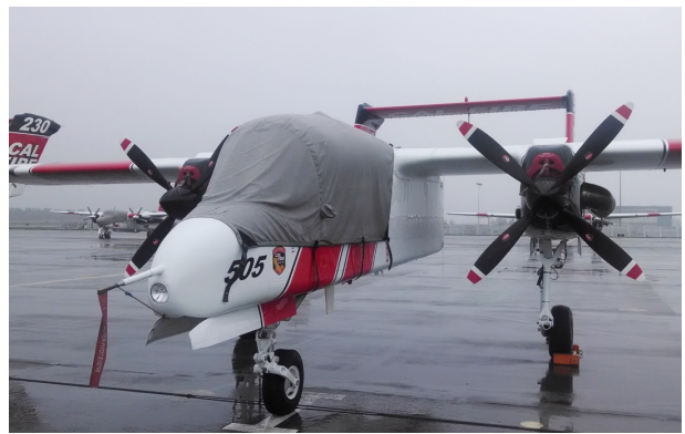
Rockwell OV-10 Canopy Cover