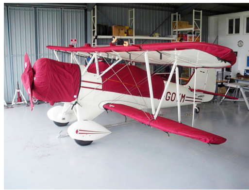
Waco UPF-7 Canopy, Wings, Stab's, Engine, Prop Covers