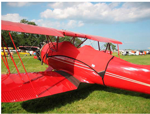
Waco UPF7 Canopy Cover