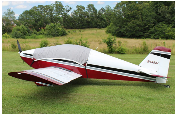
OneX Canopy Cover