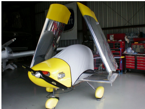
Onex Flyaway Cover

Travel Covers are made with Silver Solution-Dyed Polyester fabric and only lined over the windshield to save weight. The material is lightweight and more compact for easy stowage in the aircraft. The polyester material is water resistant, but only intended for occasional use outside. We also have an ultra lightweight material available for fitted hangar dust covers. For daily outdoor use, the non-travel Sunbrella Cover is the best choice.