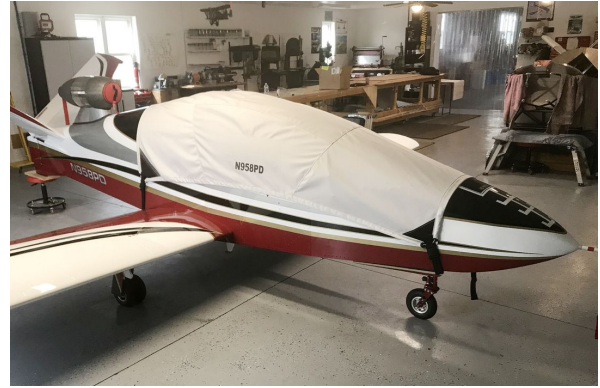
Subsonex Canopy Cover