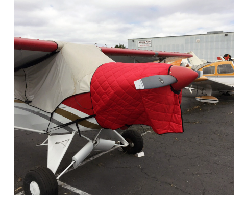
Glastar Insulated Engine Cover