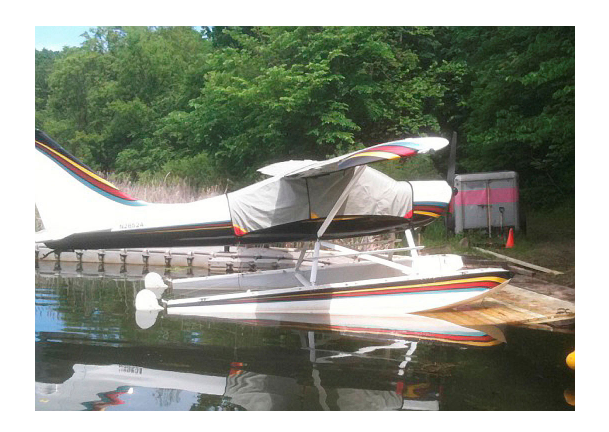
Glastar Sportsman Canopy Cover