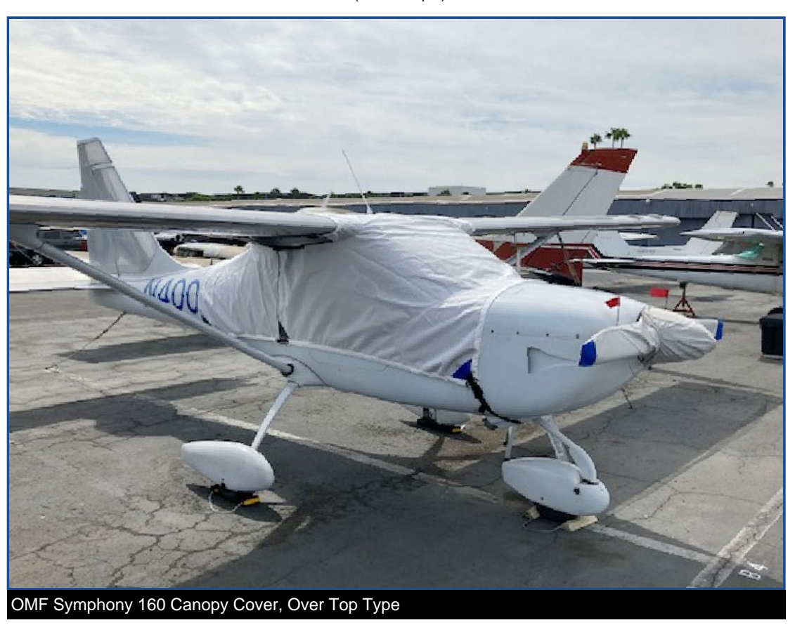
Section 1: Canopy/Cockpit/Fuselage Covers

The OMF Symphony 160 Over-The-Top Style Canopy Cover encloses the windshield, side and rear windows, and extends over the top of the airplane to cover the section between the wings. This is a one-piece design, which wraps around the canopy and closes with a Velcro closure behind the pilot's side door, and at the same place on the copilot's side of the cabin. By opening the Velcro closure on the door side, one can enter the airplane without removing the entire cover. The cover will extend over the top of the cabin area to cover the wing root fairings to help protect against leaks. The cover fastens with two belly straps that are adjustable and detachable from either side with heavy-duty quick-release plastic buckles. To keep the sides of the cover snug, special tightening straps are sewn onto the upper hem on each side. To ensure the most secure fit, high-quality shock cord is enclosed in the hem of the cover to help keep the cover tighter against the airplane. Canopy Covers are commonly referred to as Cabin Covers, Fuselage Covers, Canvas Covers, etc.