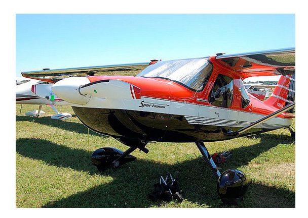
Glastar Sportsman Windshield HeatShield

Windshield Heatshields are interior sunshades for an aircraft's front windshield. The product is a unique composite of closed-cell foam with a silver mylar finish. The semi-rigid design is stiff enough to stand along the inside of the windshield using sun visors or window framing. It folds up flat and easily stores in the included storage sleeve. Some designs may require velcro and suction cups or split right and left sides. A Heatshield is an excellent short-term remedy for cockpit overheating. An external fabric cover is far more effective and practical for long-term protection.