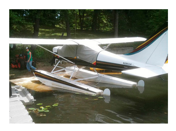
Glastar Sportsman Canopy Cover