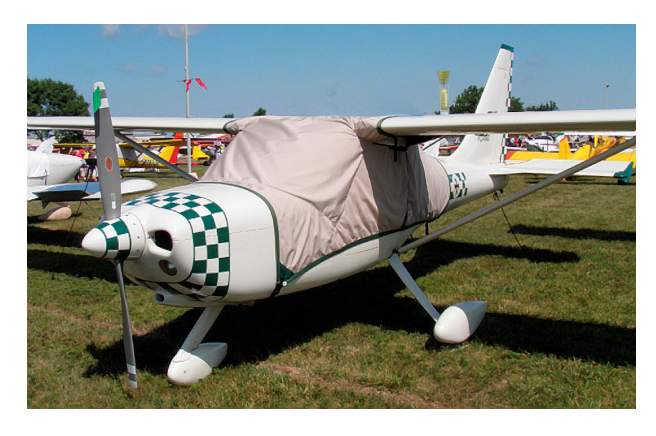
Glastar Over-Top Canopy Cover