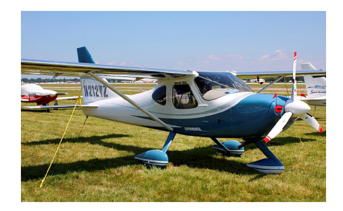
Glastar Sportsman Engine Inlet Plugs