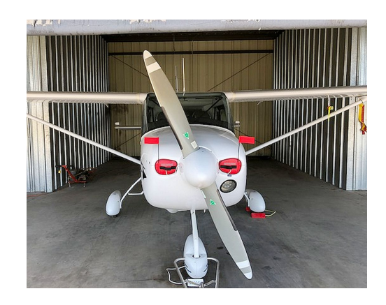
2006 OMF Symphony SA160

Engine Inlet Plugs are custom fit for your OMF Symphony 160 intakes, made with heavy-duty vinyl material, and stuffed with a single block of sculpted urethane foam. Each plug has a zipper that allows the foam to be removed and dried if necessary. Engine plugs have warning flags that are visible from the cockpit or 'remove before flight' streamers sewn onto the face of the plugs. Most plugs are imprinted with the aircraft registration number in black for an extra charge. Storage bag NOT included. Engine plugs may be inserted after flight when the engine is still warm. Engine Inlet Plugs are commonly referred to as Cowl Plugs, Intake Plugs, Cowl Blocks, Engine Blocks, and Engine Bungs.