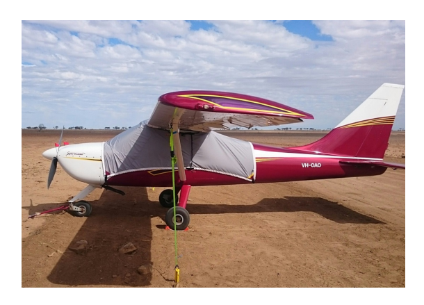
Glastar Sportsman Light Weight Travel Cover

This cover type is made from Silver Acrylic Sunbrella canvas and is 100% lined with a soft and smooth microfiber. Bruce's Custom Covers developed this material combination especially for aircraft protection. The outer material is medium weight and treated for water resistance, UV resistance and anti-static buildup. The inner lining is a very soft and smooth microfiber to prevent scratching. The material is very reflective, and tests show that the cabin interior temperature can be reduced to near-ambient temperature on the hottest of days. It is water, ice and snow repellent, yet breathable to allow moisture to escape from between the cover and the aircraft surface.