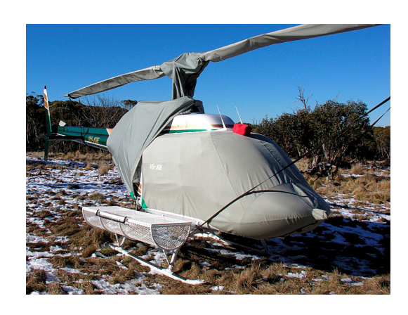
JetRanger Bubble, Engine, Rotor Hub & Blade Covers (& Tie-Downs)