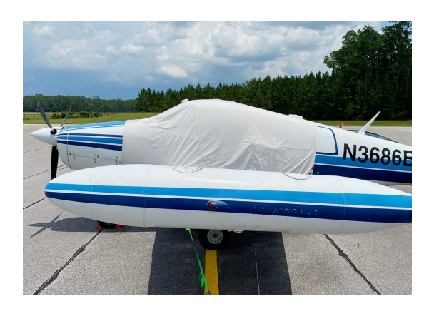
Navion Rangemaster Extended Canopy Cover

This cover type is made from Silver Acrylic Sunbrella canvas and is 100% lined with a soft and smooth microfiber. Bruce's Custom Covers developed this material combination especially for aircraft protection. The outer material is medium weight and treated for water resistance, UV resistance and anti-static buildup. The inner lining is a very soft and smooth microfiber to prevent scratching. The material is very reflective, and tests show that the cabin interior temperature can be reduced to near-ambient temperature on the hottest of days. It is water, ice and snow repellent, yet breathable to allow moisture to escape from between the cover and the aircraft surface.