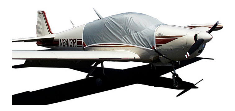
Covers & Plugs for the Navion Rangemaster