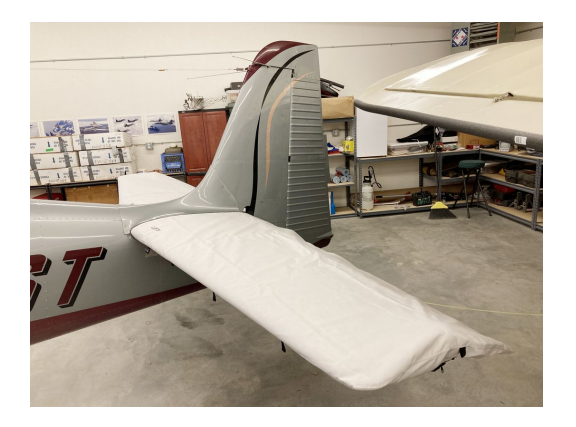
Navion Rangemaster Horizontal Stabilizer Covers