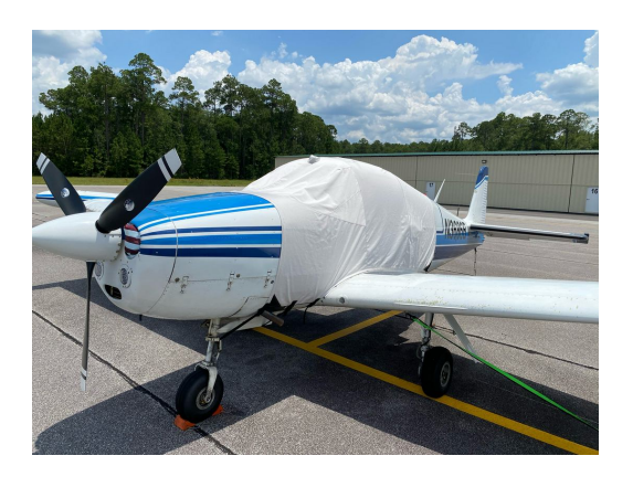
Navion Rangemaster Extended Canopy Cover