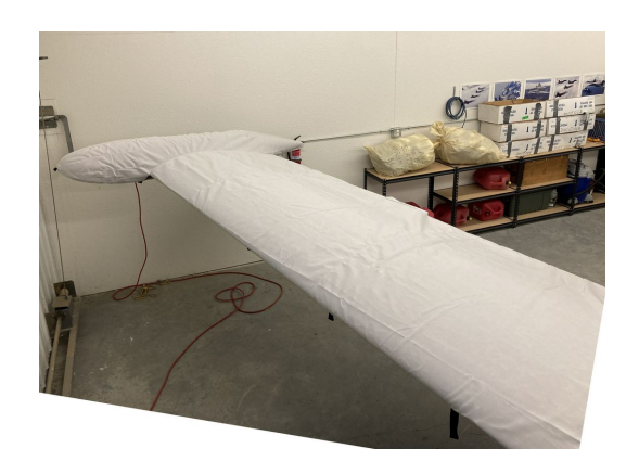
Navion Rangemaster Wing Covers

mitigation, or for occasional travel. The material is lighter and more compact, but more susceptible to UV damage and may have a shorter useful life if used continuously outside than the all-year use material.