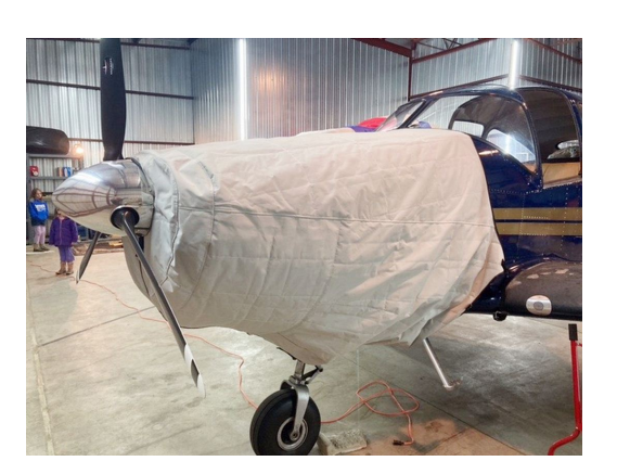
Navion Insulated Engine Cover