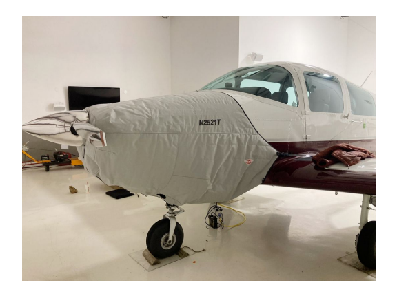
NAVION H Insulated Engine Cover

This cover type is made from Silver Acrylic Sunbrella canvas and is 100% lined with a soft and smooth microfiber. Bruce's Custom Covers developed this material combination especially for aircraft protection. The outer material is medium weight and treated for water resistance, UV resistance and anti-static buildup. The inner lining is a very soft and smooth microfiber to prevent scratching. The material is very reflective, and tests show that the cabin interior temperature can be reduced to near-ambient temperature on the hottest of days. It is water, ice and snow repellent, yet breathable to allow moisture to escape from between the cover and the aircraft surface.