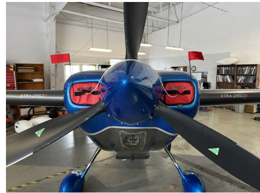
Extra 260 Engine Inlet Plugs