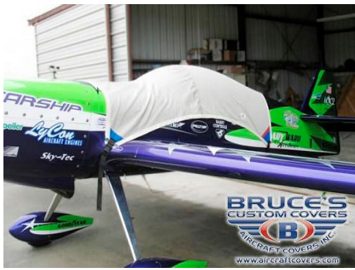
MX-2 Canopy Cover