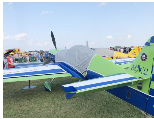
MX2 Lightweight Travel Canopy Cover