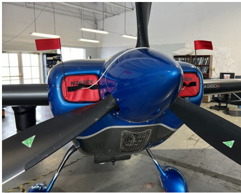
Extra 260 Engine Inlet Plugs

Engine Inlet Plugs are custom fit for your MXR Technologies MXS & MX2 intakes, made with heavy-duty vinyl material, and stuffed with a single block of sculpted urethane foam. Each plug has a zipper that allows the foam to be removed and dried if necessary. Engine plugs have warning flags that are visible from the cockpit or 'remove before flight' streamers sewn onto the face of the plugs. Most plugs are imprinted with the aircraft registration number in black for an extra charge. Storage bag NOT included. Engine plugs may be inserted after flight when the engine is still warm. Engine Inlet Plugs are commonly referred to as Cowl Plugs, Intake Plugs, Cowl Blocks, Engine Blocks, and Engine Bungs.