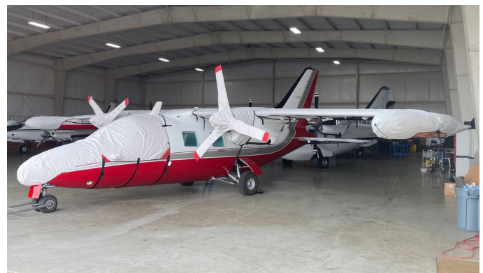
MU-2 Cockpit/Nose, Wing/Engine & Prop Covers