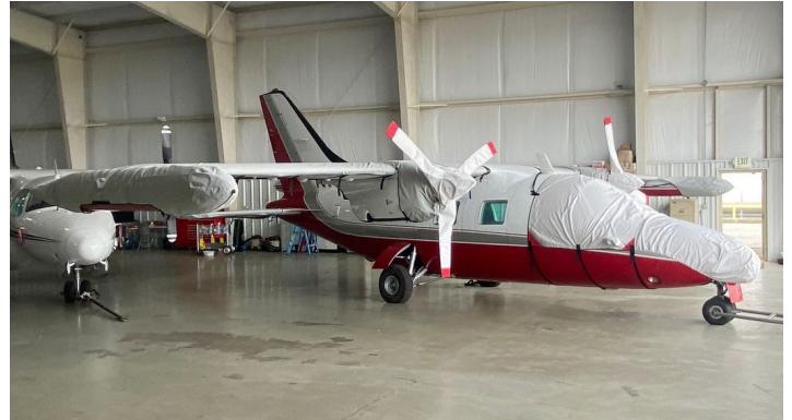
MU-2 Cockpit/Nose, Wing/Engine & Prop Covers