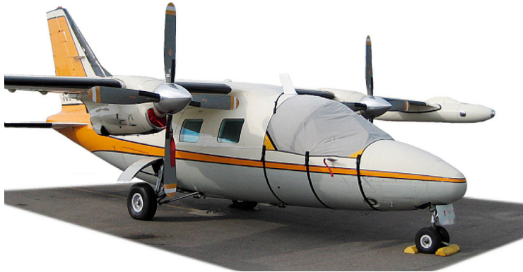
MU-2 Windshield Cover & Engine Plugs

This cover type is made from Silver Acrylic Sunbrella canvas and is 100% lined with a soft and smooth microfiber. Bruce's Custom Covers developed this material combination especially for aircraft protection. The outer material is medium weight and treated for water resistance, UV resistance and anti-static buildup. The inner lining is a very soft and smooth microfiber to prevent scratching. The material is very reflective, and tests show that the cabin interior temperature can be reduced to near-ambient temperature on the hottest of days. It is water, ice and snow repellent, yet breathable to allow moisture to escape from between the cover and the aircraft surface.