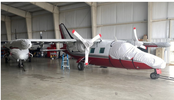
MU-2 Cockpit/Nose, Wing/Engine & Prop Covers

WINTER USE MATERIAL - Made with Solution-Dyed Polyester fabric, this option is intended for seasonal use to aid in deicing, rain mitigation, or for occasional travel. The material is lighter and more compact, but more susceptible to UV damage and may have a shorter useful life if used continuously outside than the all-year use material.