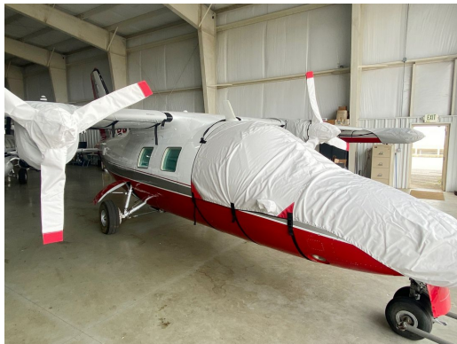
MU-2 Cockpit/Nose, Wing/Engine & Prop Covers

This cover type is made from Silver Acrylic Sunbrella canvas and is 100% lined with a soft and smooth microfiber. Bruce's Custom Covers developed this material combination especially for aircraft protection. The outer material is medium weight and treated for water resistance, UV resistance and anti-static buildup. The inner lining is a very soft and smooth microfiber to prevent scratching. The material is very reflective, and tests show that the cabin interior temperature can be reduced to near-ambient temperature on the hottest of days. It is water, ice and snow repellent, yet breathable to allow moisture to escape from between the cover and the aircraft surface.