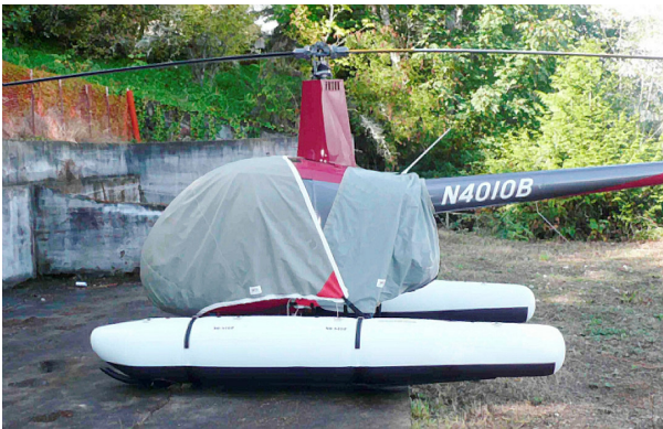
Robinson R-22 Standard Bubble Cover & Engine Cover

Bruce's Autogyro MTO Sport, 2010, 2017 Gyrocopter Blade Covers are made of medium-weight Solution-Dyed Polyester and designed to avoid trim tabs or wicks. You can install Blade Covers from the ground with the aid of a lightweight rope attached to the open end. Covers are cinched tight at the blade root with straps and quick-release plastic buckles. The Cold Weather Blade Covers are fitted with full-length zippers and optional deice "boots" designed to accept a preheater hose; a small opening at the tip of the cover allows for some air circulation and drainage in freezing weather. Some part numbers have features for an extra charge.