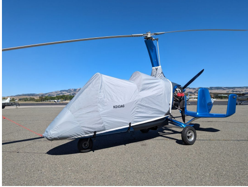
Autogyro MTOSPORT Travel Cover, Light Weight Canopy/Nose Cover

Travel Covers are made with Silver Solution-Dyed Polyester fabric and fully lined over the entire cover. The material is lightweight and more compact for easy stowage in the aircraft. The polyester material is water resistant, but only intended for occasional use outside. We also have an ultra lightweight material available for fitted hangar dust covers. For daily outdoor use, the non-travel Sunbrella Cover is the best choice.