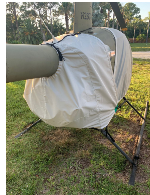
Robinson R-22 Engine Cover