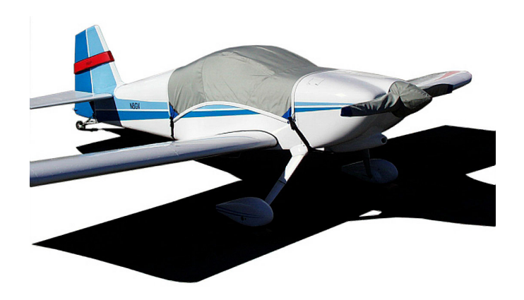
Canopy Cover, Prop Cover