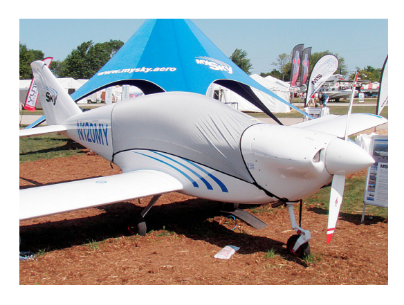
Mysky Fly-Away Travel Cover