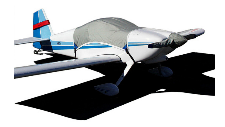
Canopy Cover, Prop Cover

Travel Covers are made with Silver Solution-Dyed Polyester fabric and only lined over the windshield to save weight. The material is lightweight and more compact for easy stowage in the aircraft. The polyester material is water resistant, but only intended for occasional use outside. We also have an ultra lightweight material available for fitted hangar dust covers. For daily outdoor use, the non-travel Sunbrella Cover is the best choice.