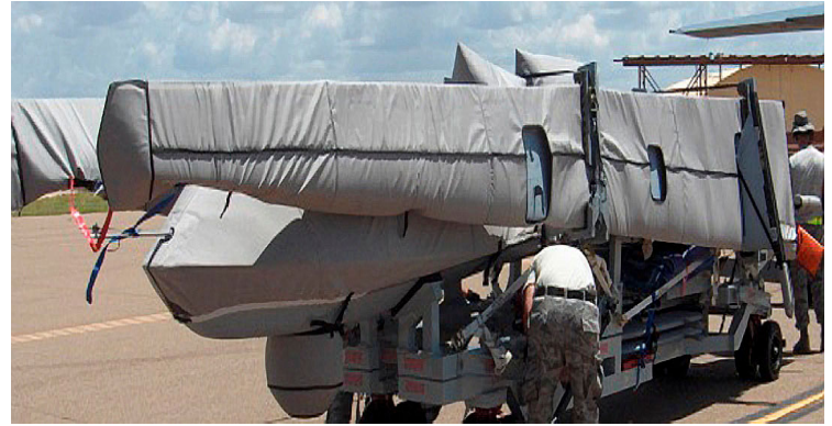
MQ1 Fuselage and Wing Covers