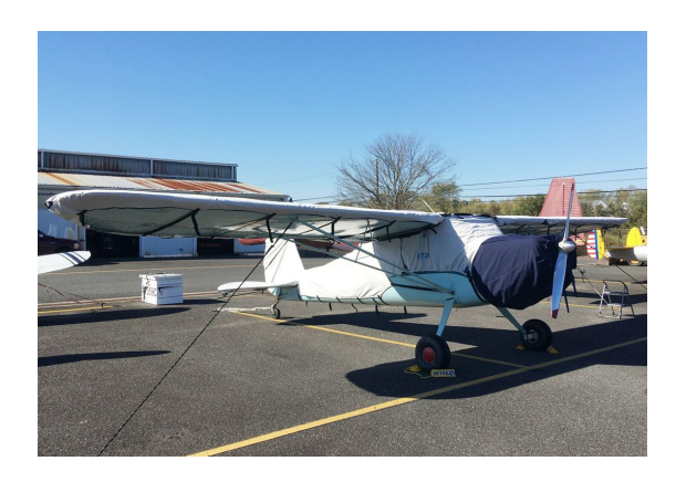
Cessna 140 Canopy, Engine, Wing & Empennage Covers

WINTER USE MATERIAL - Made with Solution-Dyed Polyester fabric, this option is intended for seasonal use to aid in deicing, rain mitigation, or for occasional travel. The material is lighter and more compact, but more susceptible to UV damage and may have a shorter useful life if used continuously outside than the all-year use material.