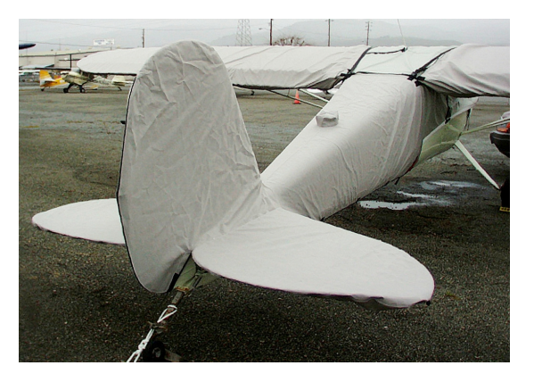
Cessna 120 Empennage Cover