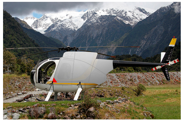
Engine Cover (illustration)