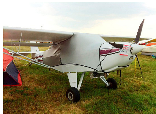
Kitfox Spandex FlyAway Travel Canopy Cover