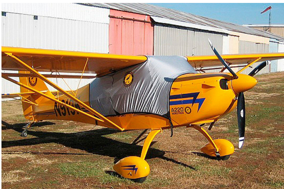
Aerotrek A220 Fitted Hangar Dust Cover

Travel Covers are made with Silver Solution-Dyed Polyester fabric and only lined over the windshield to save weight. The material is lightweight and more compact for easy stowage in the aircraft. The polyester material is water resistant, but only intended for occasional use outside. We also have an ultra lightweight material available for fitted hangar dust covers. For daily outdoor use, the non-travel Sunbrella Cover is the best choice.