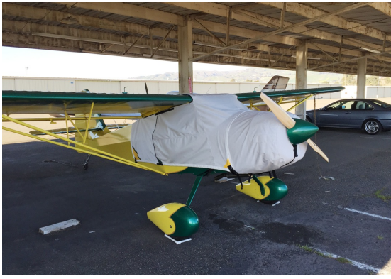
Kitfox Canopy & Engine Covers