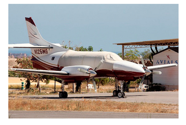
Merlin Canopy Cover

Travel Covers are made with Silver Solution-Dyed Polyester fabric and only lined over the windshield to save weight. The material is lightweight and more compact for easy stowage in the aircraft. The polyester material is water resistant, but only intended for occasional use outside. We also have an ultra lightweight material available for fitted hangar dust covers. For daily outdoor use, the non-travel Sunbrella Cover is the best choice.