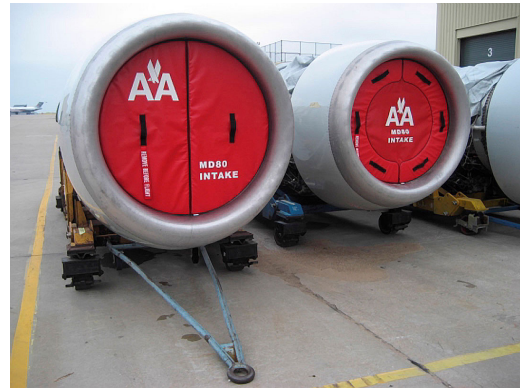
MD-80 JT8D Intake Plugs, Solid Foam folding type & Mesh Center folding type