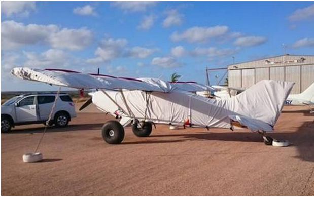
Maule M7-235 Extended Canopy, Wing, Engine & Empennage Covers

This cover type is made from Silver Acrylic Sunbrella canvas and is 100% lined with a soft and smooth microfiber. Bruce's Custom Covers developed this material combination especially for aircraft protection. The outer material is medium weight and treated for water resistance, UV resistance and anti-static buildup. The inner lining is a very soft and smooth microfiber to prevent scratching. The material is very reflective, and tests show that the cabin interior temperature can be reduced to near-ambient temperature on the hottest of days. It is water, ice and snow repellent, yet breathable to allow moisture to escape from between the cover and the aircraft surface.