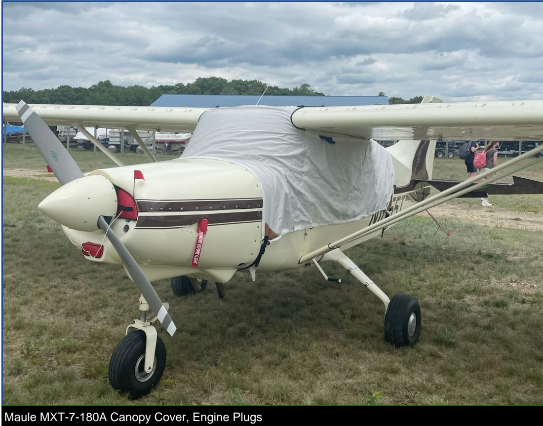
Maule MXT-7-180A Canopy Cover, Engine Plugs