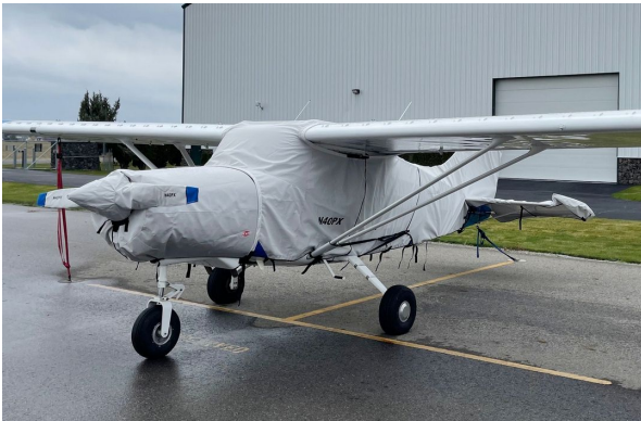
Maule MX7-180 Prop, Engine, Extended Canopy & Empennage Covers

WINTER USE MATERIAL - Made with Solution-Dyed Polyester fabric, this option is intended for seasonal use to aid in deicing, rain mitigation, or for occasional travel. The material is lighter and more compact, but more susceptible to UV damage and may have a shorter useful life if used continuously outside than the all-year use material.