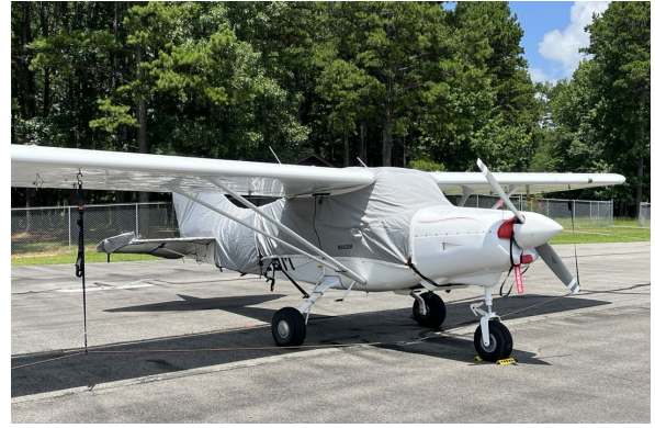
Maule MXT-7-180 Canopy & Empennage Covers, travel weight Maule MXT-7-180 Canopy & Empennage Covers, travel weight