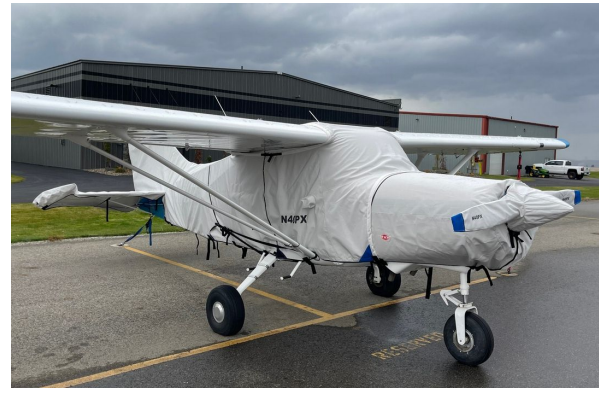
Maule MX7-180 Prop, Engine, Extended Canopy & Empennage Covers