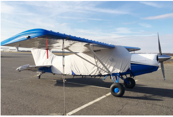
Maule M-5-235C Extended Canopy Cover, Empennage Cover