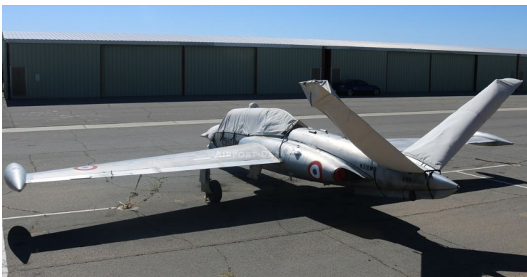
Fougla Magister Canopy/Nose Cover, Tail Stabilizer Covers

WINTER USE MATERIAL - Made with Solution-Dyed Polyester fabric, this option is intended for seasonal use to aid in deicing, rain mitigation, or for occasional travel. The material is lighter and more compact, but more susceptible to UV damage and may have a shorter useful life if used continuously outside than the all-year use material.