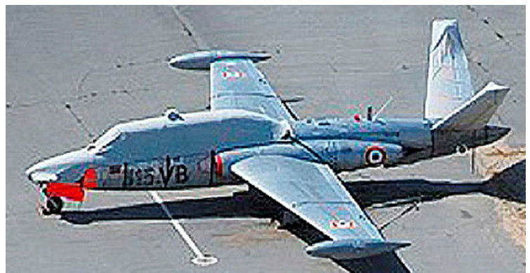
Fougla Magister Canopy/Nose & Stabilizer Covers