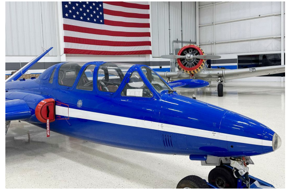
Fougla Magister CM170 Intake Plugs