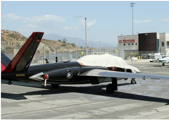
Fougla Magister Canopy/Nose Cover with nose mount loop antenna