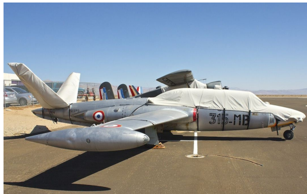
Fouga Magister Canopy/Nose Cover, Tail Stabilizer Covers