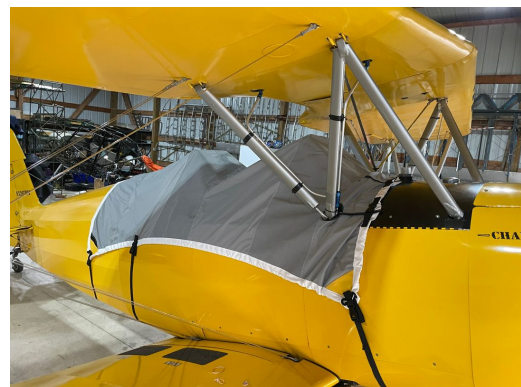
Marquardt Charger Travel Weight Canopy Cover