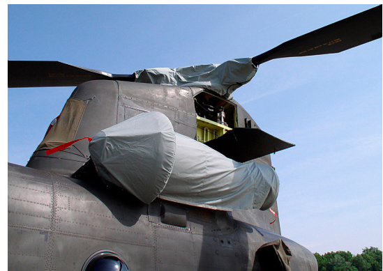
Boeing Vertol CH-47 Engine and Rotor Hub Covers