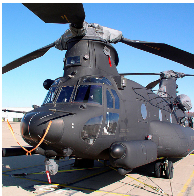
Boeing Vertol MH-47 Rotor Hubs, Engine & Other Covers

Insulated Covers Material - A special composite material of solution-dyed polyester, 3M Thinsulate insulation, and soft nylon interior fabric. Our insulated covers are designed to complement an engine preheater and help retain heat in the engine compartment after shutdown. If you operate your aircraft in cold-weather, these covers will help prevent engine wear and tear.