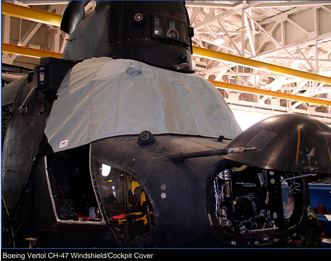
Boeing Vertol CH-47 Windshield/Cockpit Cover