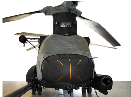
Boeing Vertol CH-47 Forward Cabin & Rotor Hub Cover