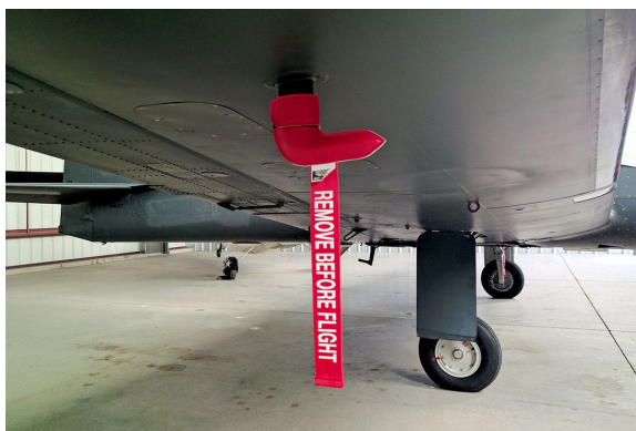
Embraer EMB 312 Tucano Pitot Covers

Engine Inlet Plugs are custom fit for your Embraer EMB 312 Tucano, T-27 intakes, made with heavy-duty vinyl material, and stuffed with a single block of sculpted urethane foam. Each plug has a zipper that allows the foam to be removed and dried if necessary. Engine plugs have warning flags that are visible from the cockpit or 'remove before flight' streamers sewn onto the face of the plugs. Most plugs are imprinted with the aircraft registration number in black for an extra charge. Storage bag NOT included. Engine plugs may be inserted after flight when the engine is still warm. Engine Inlet Plugs are commonly referred to as Cowl Plugs, Intake Plugs, Cowl Blocks, Engine Blocks, and Engine Bungs.