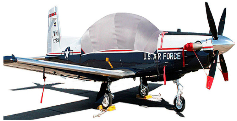
Texan II T6A Canopy Cover, Engine Inlet Plug, Prop Tie/Exhaust Covers, Pitot Cover