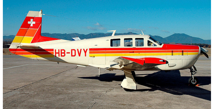
Covers for the Mooney Mustang