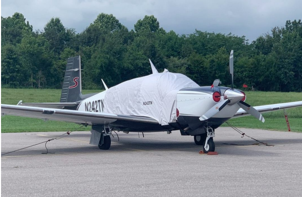
Mooney M20TN Extended Canopy Cover

This cover type is made from Silver Acrylic Sunbrella canvas and is 100% lined with a soft and smooth microfiber. Bruce's Custom Covers developed this material combination especially for aircraft protection. The outer material is medium weight and treated for water resistance, UV resistance and anti-static buildup. The inner lining is a very soft and smooth microfiber to prevent scratching. The material is very reflective, and tests show that the cabin interior temperature can be reduced to near-ambient temperature on the hottest of days. It is water, ice and snow repellent, yet breathable to allow moisture to escape from between the cover and the aircraft surface.