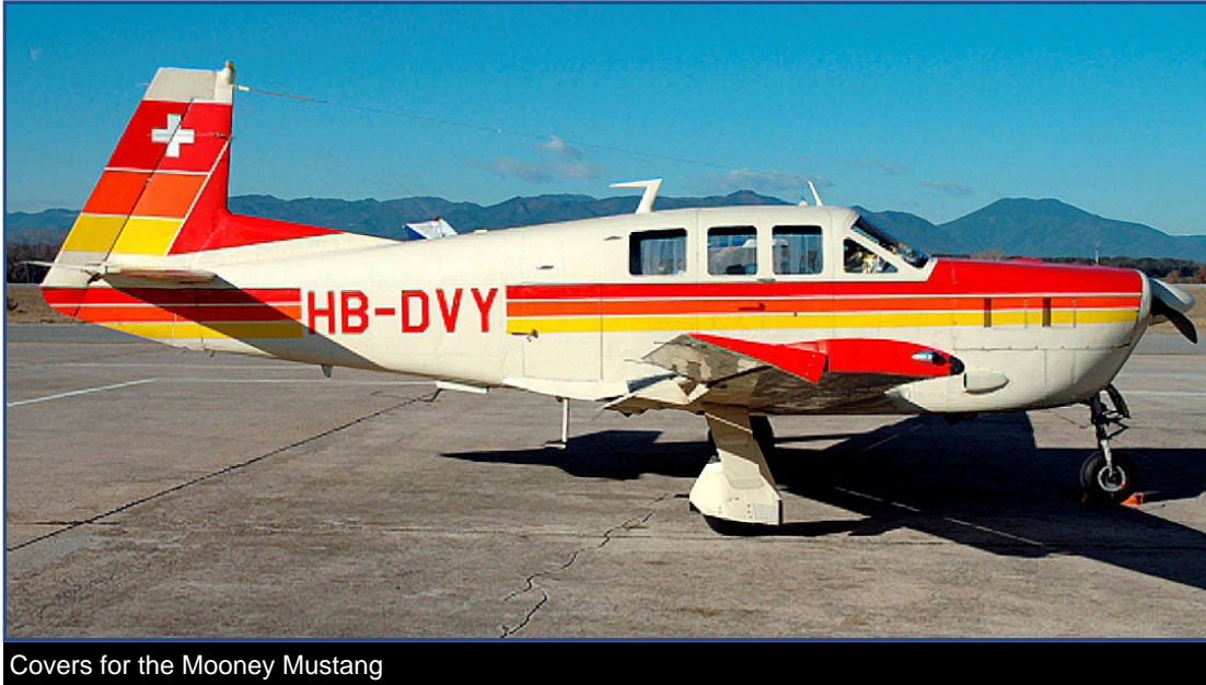
Covers for the Mooney Mustang