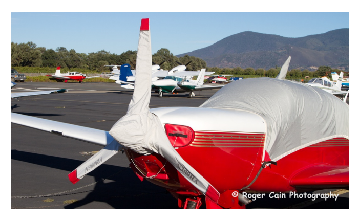
Mooney M20M Bravo 3-Blade Prop Cover, Engine Plugs