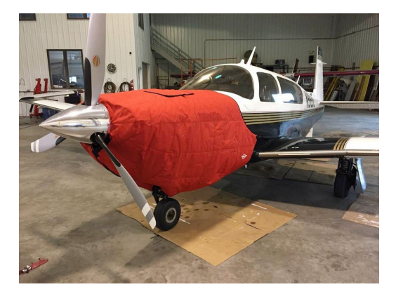
Mooney Ovation Insulated Engine Cover

This cover type is made from Silver Acrylic Sunbrella canvas and is 100% lined with a soft and smooth microfiber. Bruce's Custom Covers developed this material combination especially for aircraft protection. The outer material is medium weight and treated for water resistance, UV resistance and anti-static buildup. The inner lining is a very soft and smooth microfiber to prevent scratching. The material is very reflective, and tests show that the cabin interior temperature can be reduced to near-ambient temperature on the hottest of days. It is water, ice and snow repellent, yet breathable to allow moisture to escape from between the cover and the aircraft surface.