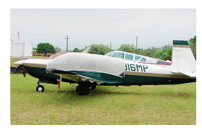
Mooney Ovation Canopy Cover