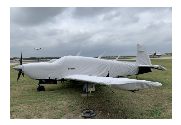
Mooney M20M Bravo Cover Set

This cover type is made from Silver Acrylic Sunbrella canvas and is 100% lined with a soft and smooth microfiber. Bruce's Custom Covers developed this material combination especially for aircraft protection. The outer material is medium weight and treated for water resistance, UV resistance and anti-static buildup. The inner lining is a very soft and smooth microfiber to prevent scratching. The material is very reflective, and tests show that the cabin interior temperature can be reduced to near-ambient temperature on the hottest of days. It is water, ice and snow repellent, yet breathable to allow moisture to escape from between the cover and the aircraft surface.