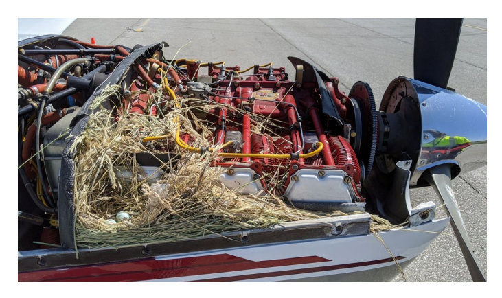
Mooney M20M Bravo 3-Blade Prop Cover, Engine Plugs ENGINE PLUGS PREVENT BIRD NEST FOD. Piper Saratoga Engine Cowling Bird's Nest